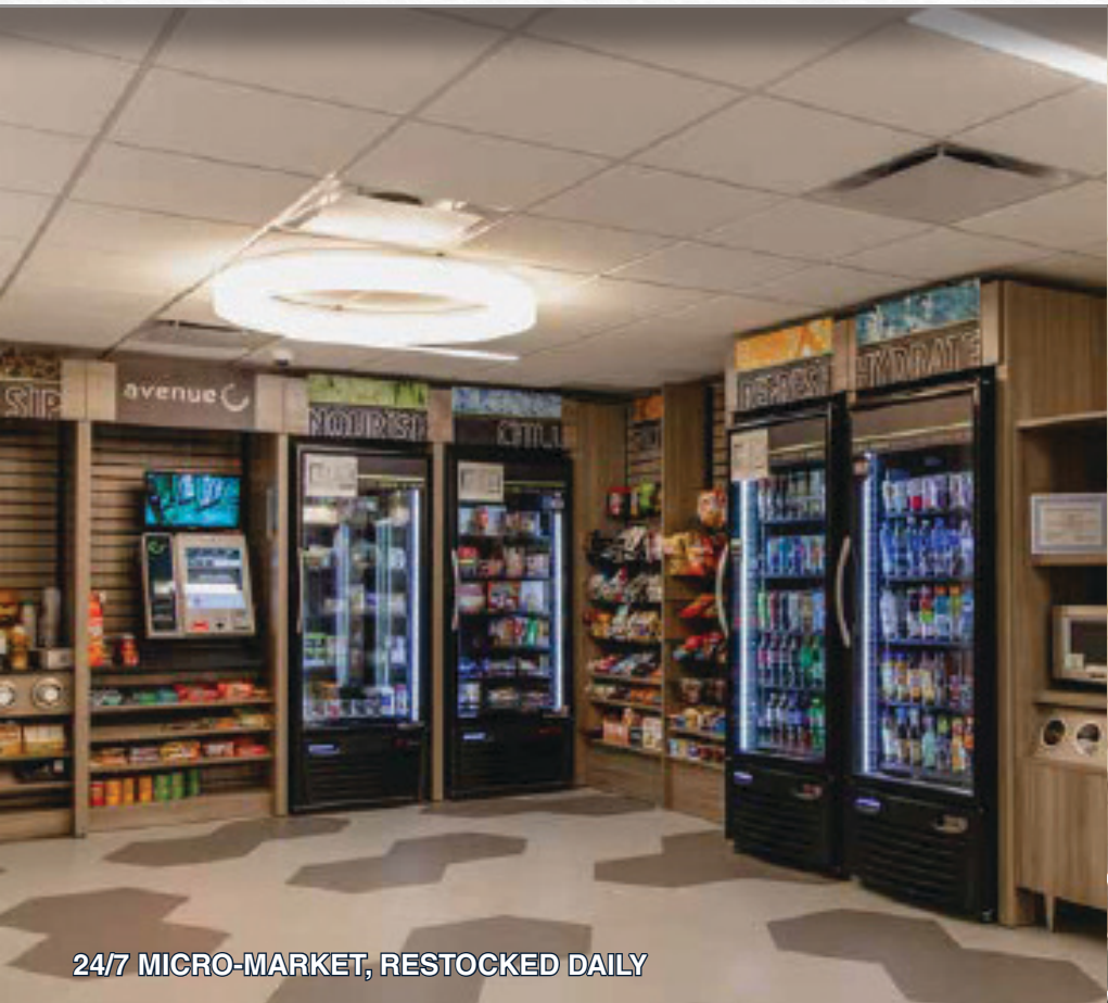
24/7 MICRO-MARKET, RESTOCKED DAILY