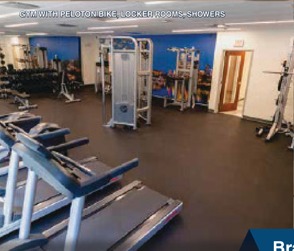
GYM WITH PELOTON BIKE, LOCKER ROOMS, SHOWERS