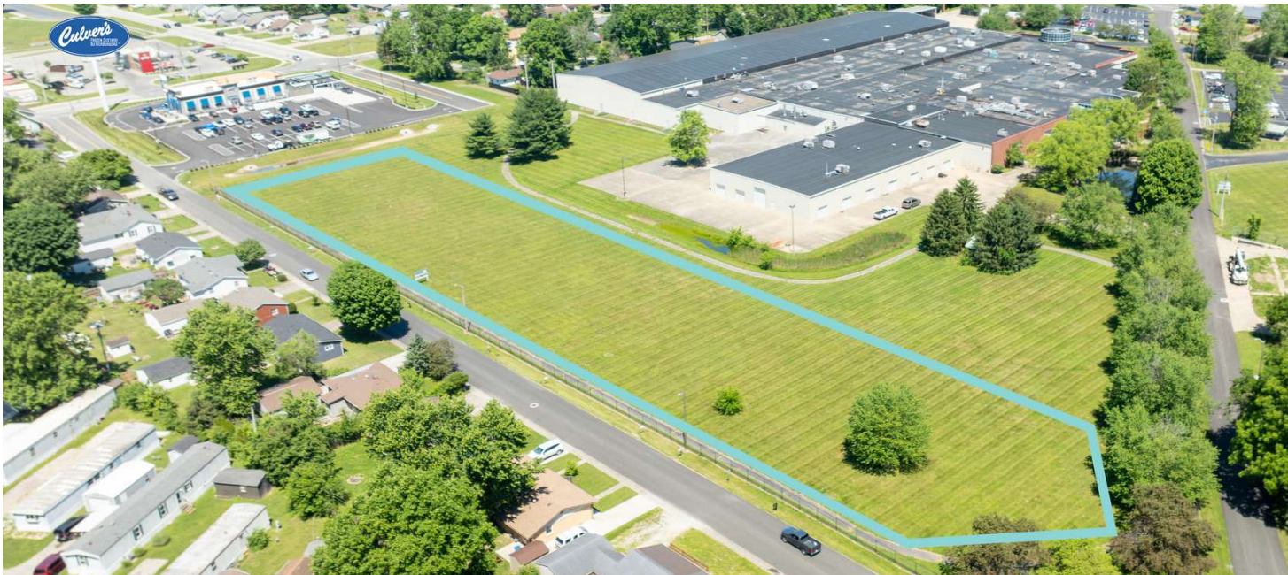
Parcel 2 (± 3.25 Acres)