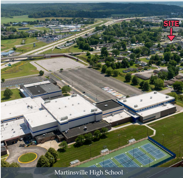
Martinsville High School