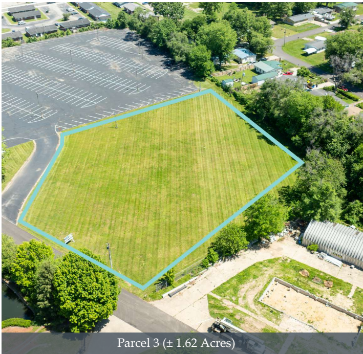
Parcel 3 (± 1.62 Acres)