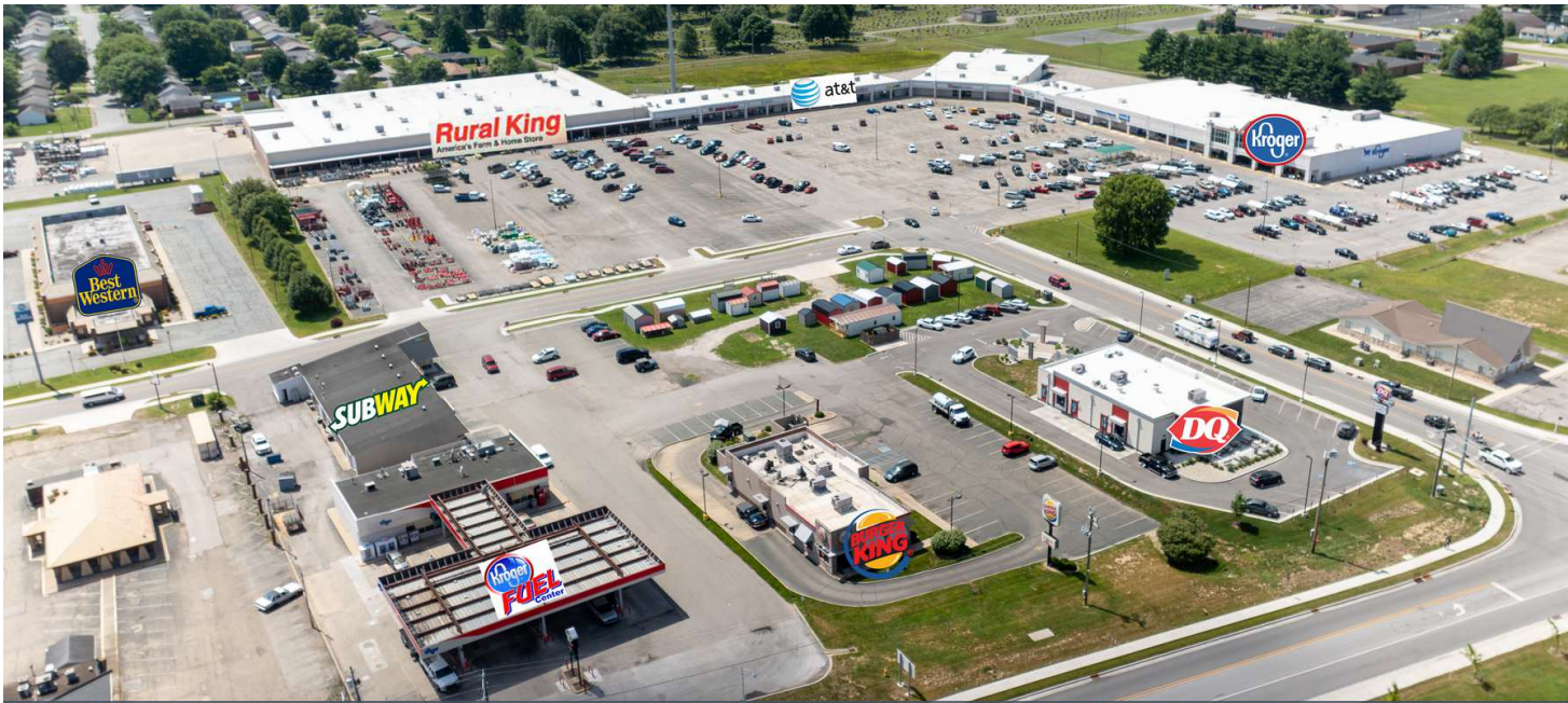
Kroger / Retail Center - Adjacent to Land Sites