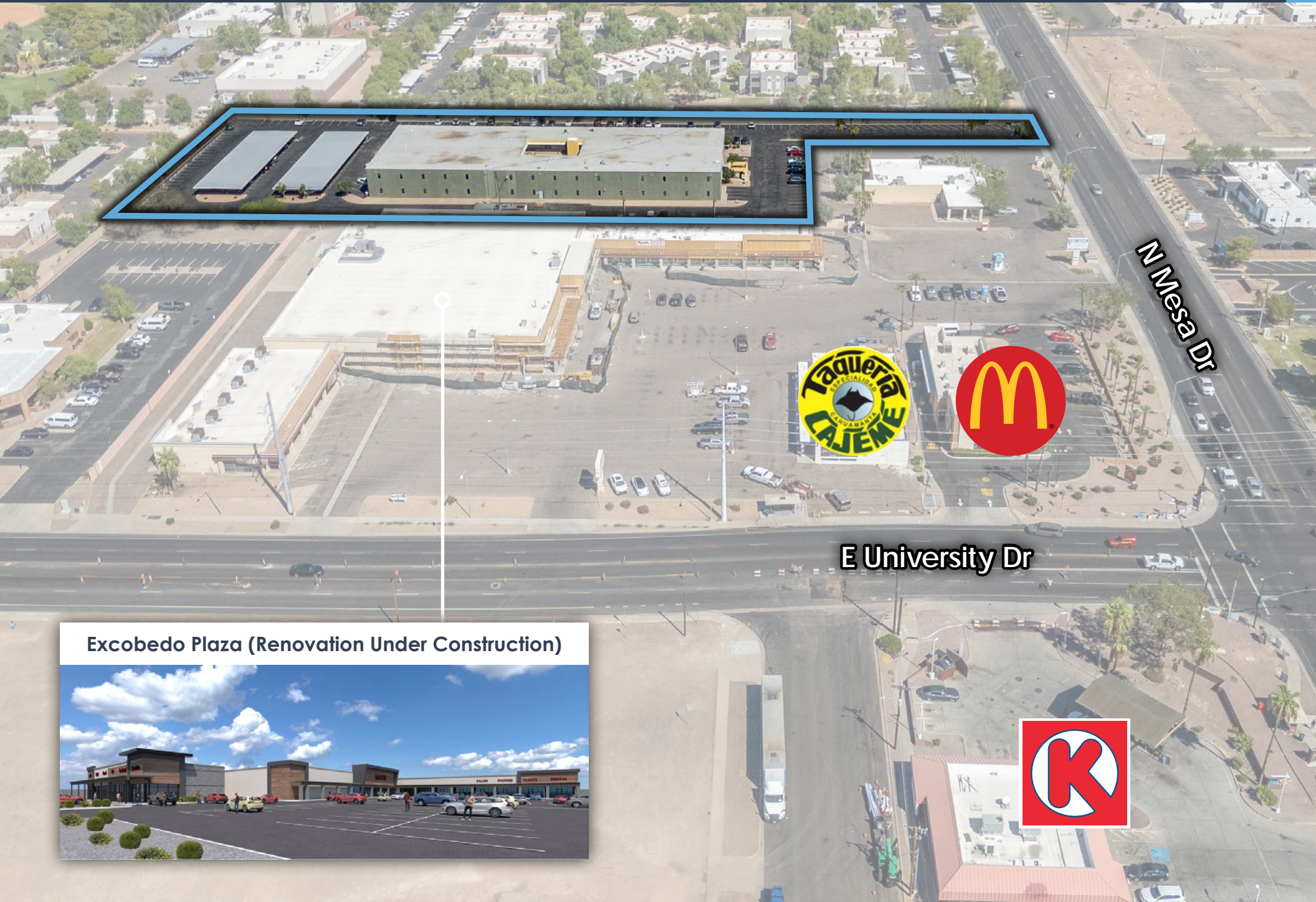
Excobedo Plaza (Renovation Under Construction)