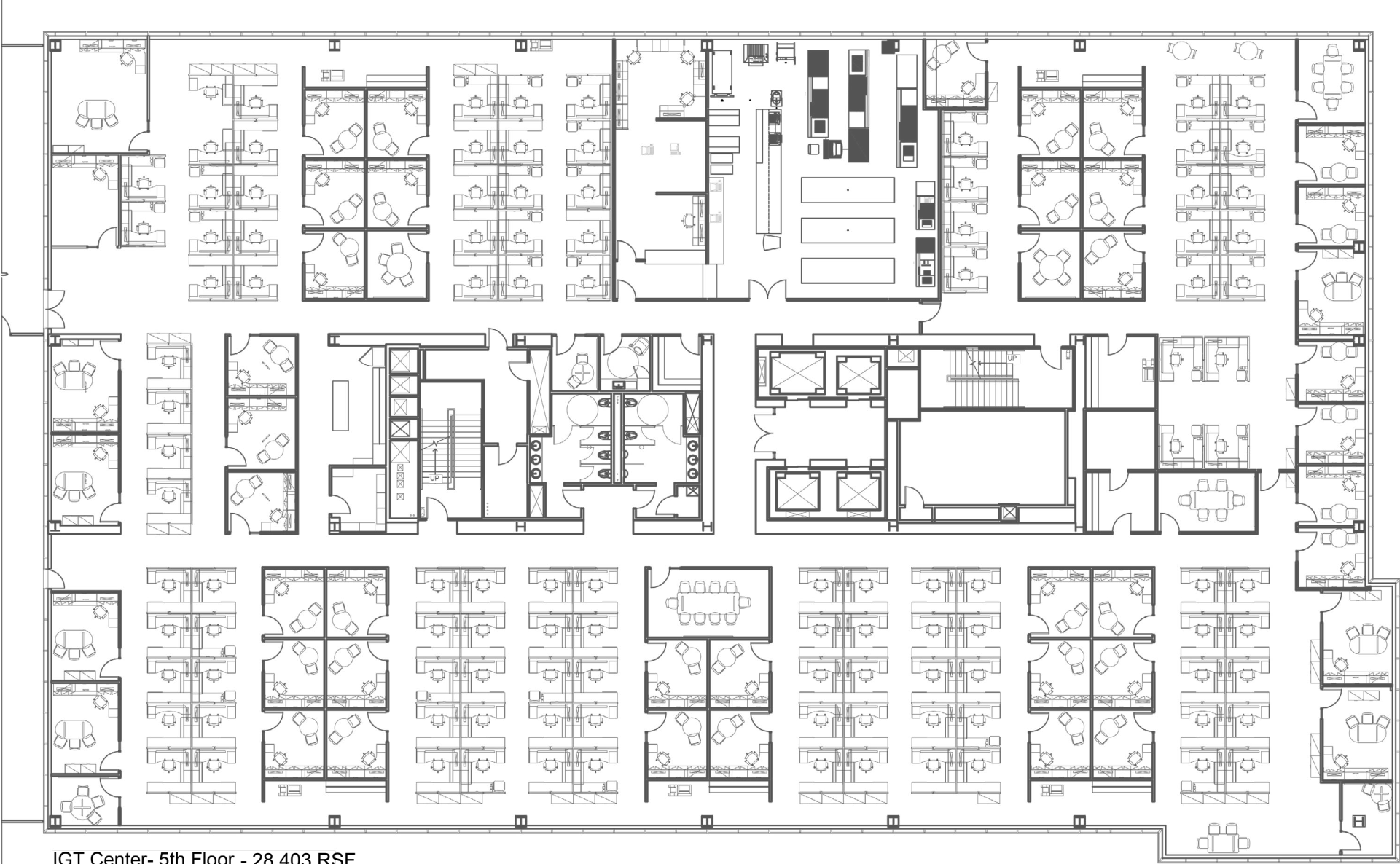
IGT Center- 5th Floor - 28,403 RSF