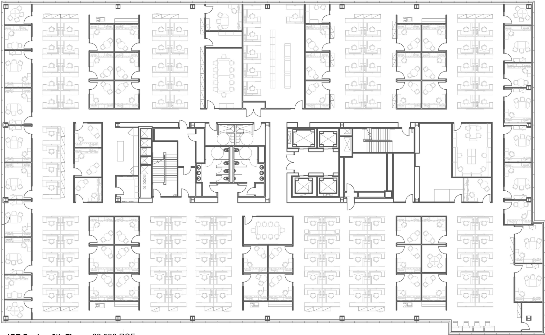
IGT Center- 6th Floor - 28,533 RSF