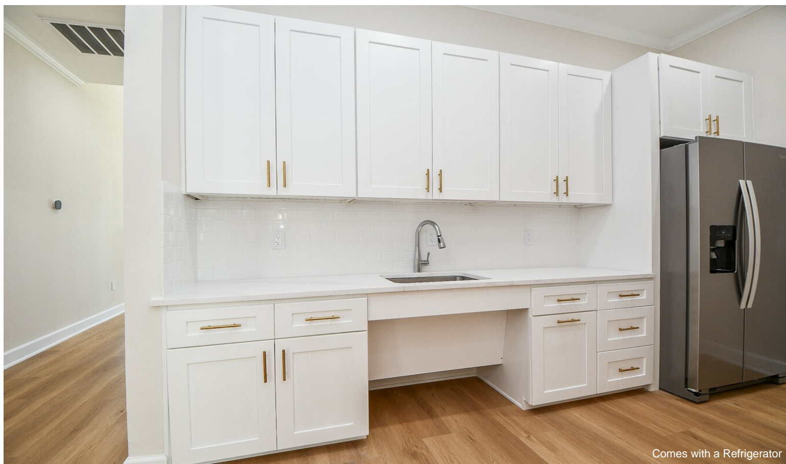
Comes with a Refrigerator