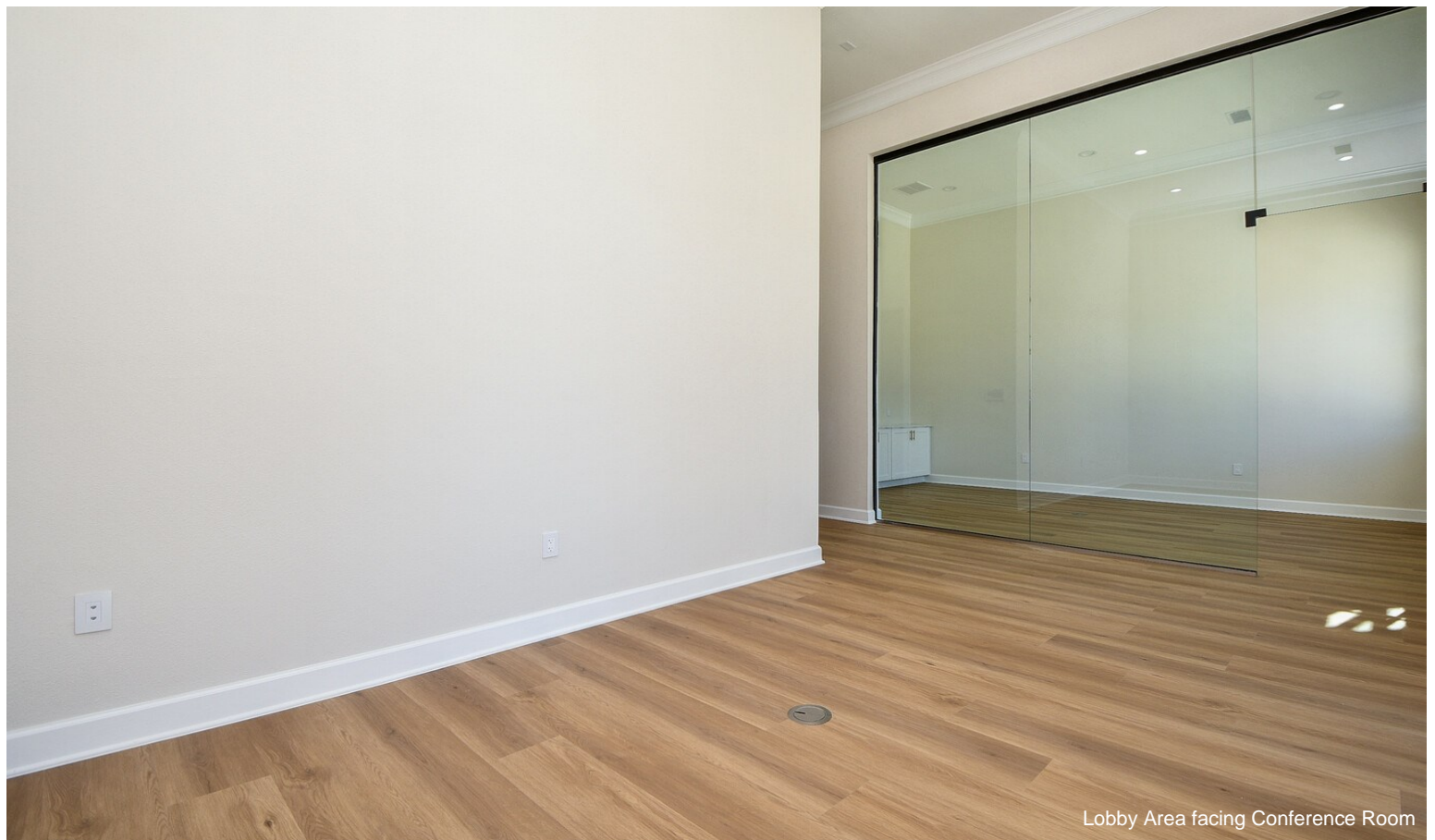
Lobby Area facing Conference Room