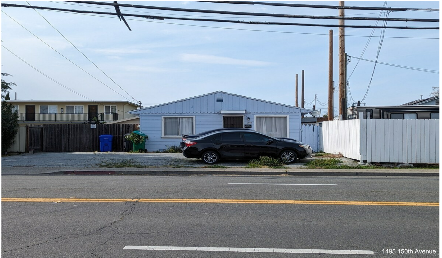
1495 150th Avenue