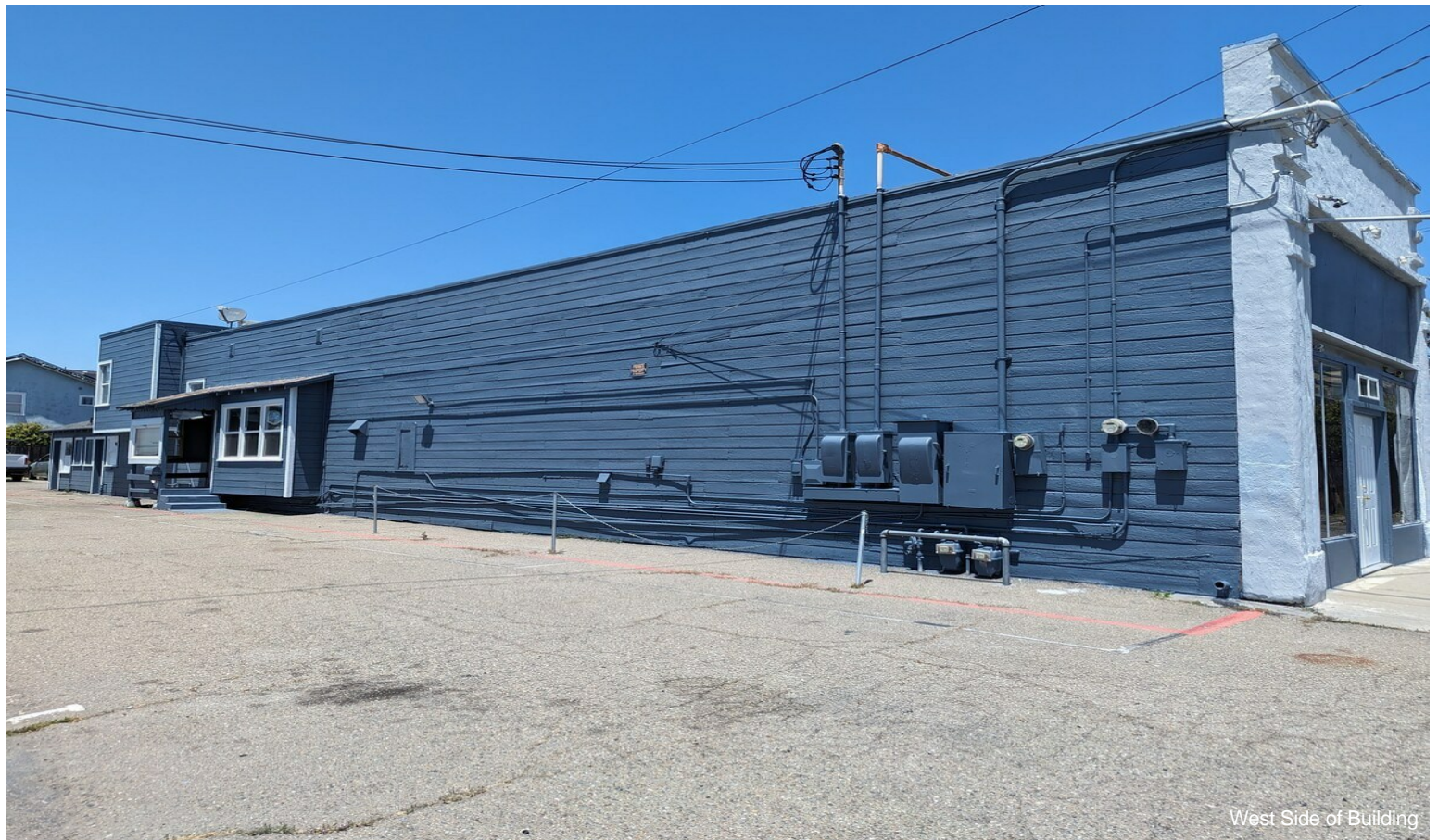
West Side of Building