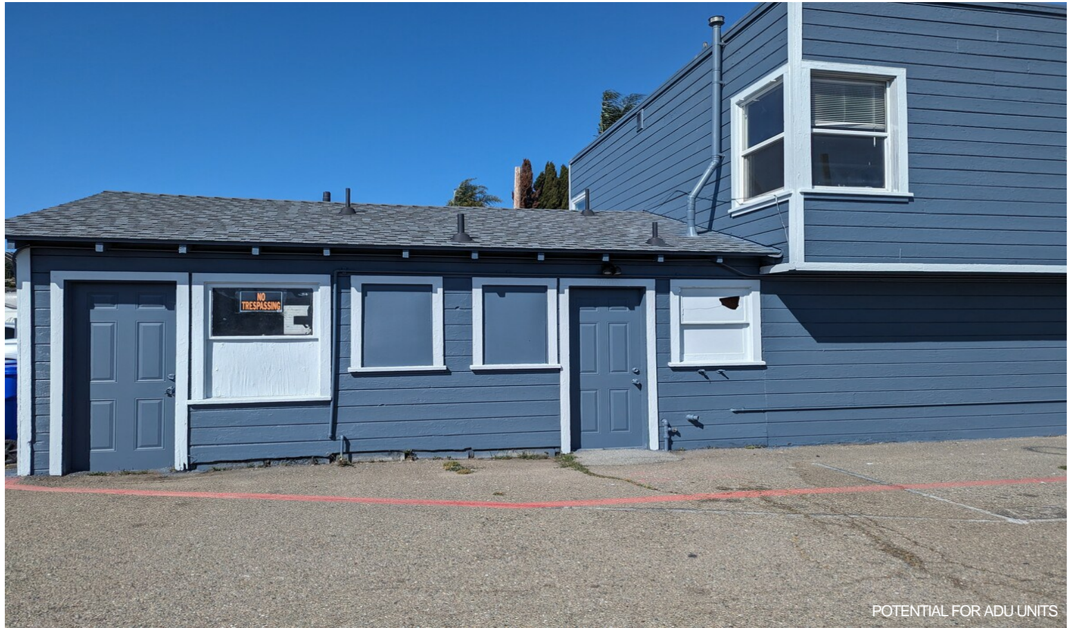
POTENTIAL FOR ADU UNITS