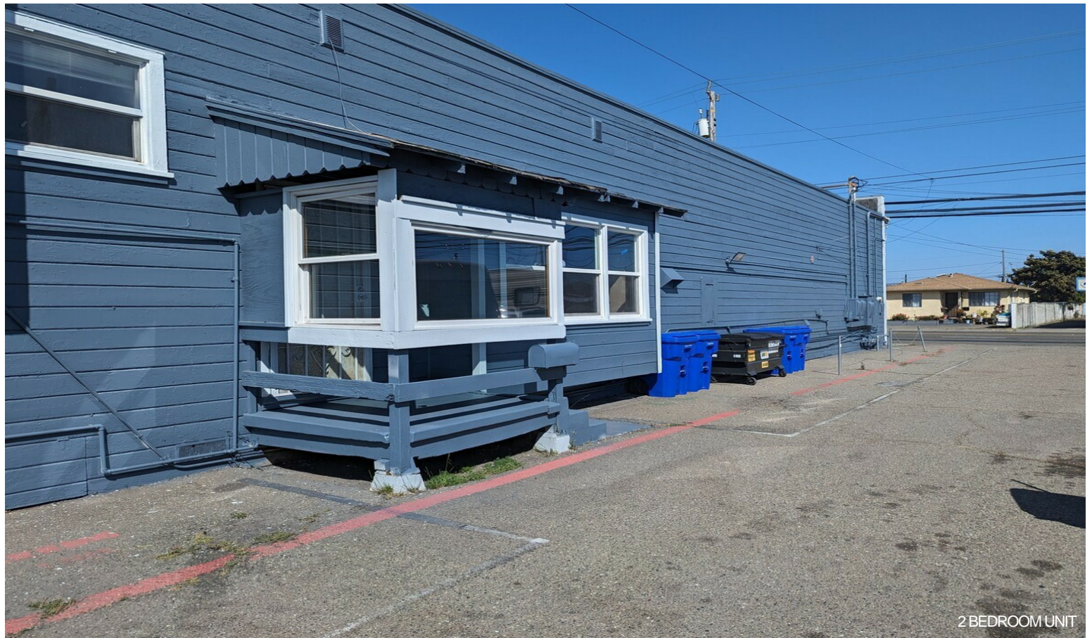
2 BEDROOM UNIT