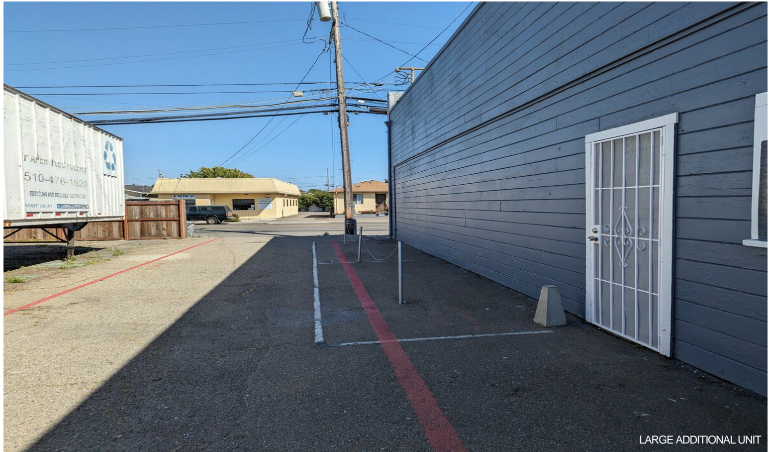
LARGE ADDITIONAL UNIT