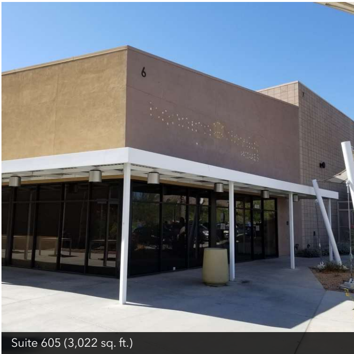
Suite 605 (3,022 sq. ft.)