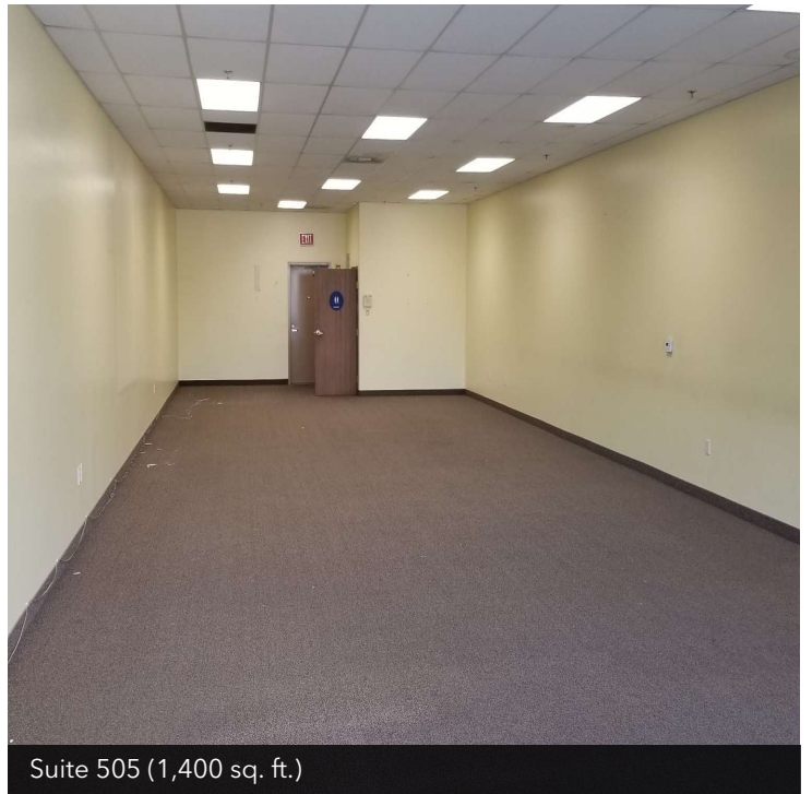
Suite 505 (1,400 sq. ft.)