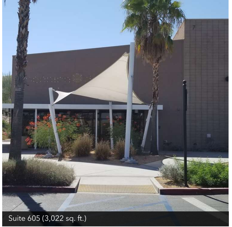
Suite 605 (3,022 sq. ft.)