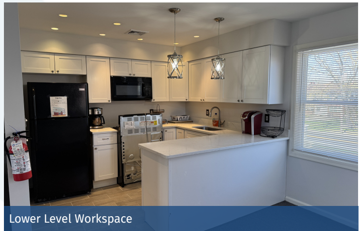
Lower Level Workspace