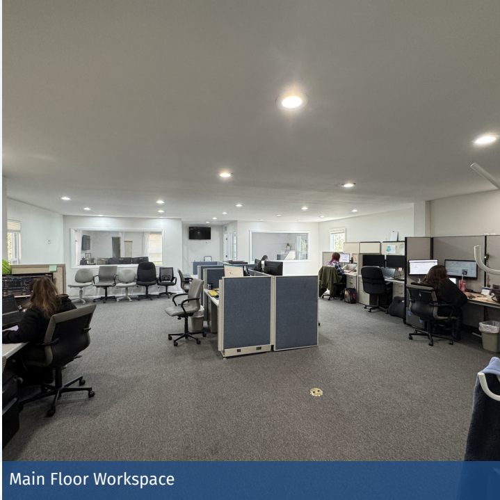
Main Floor Workspace