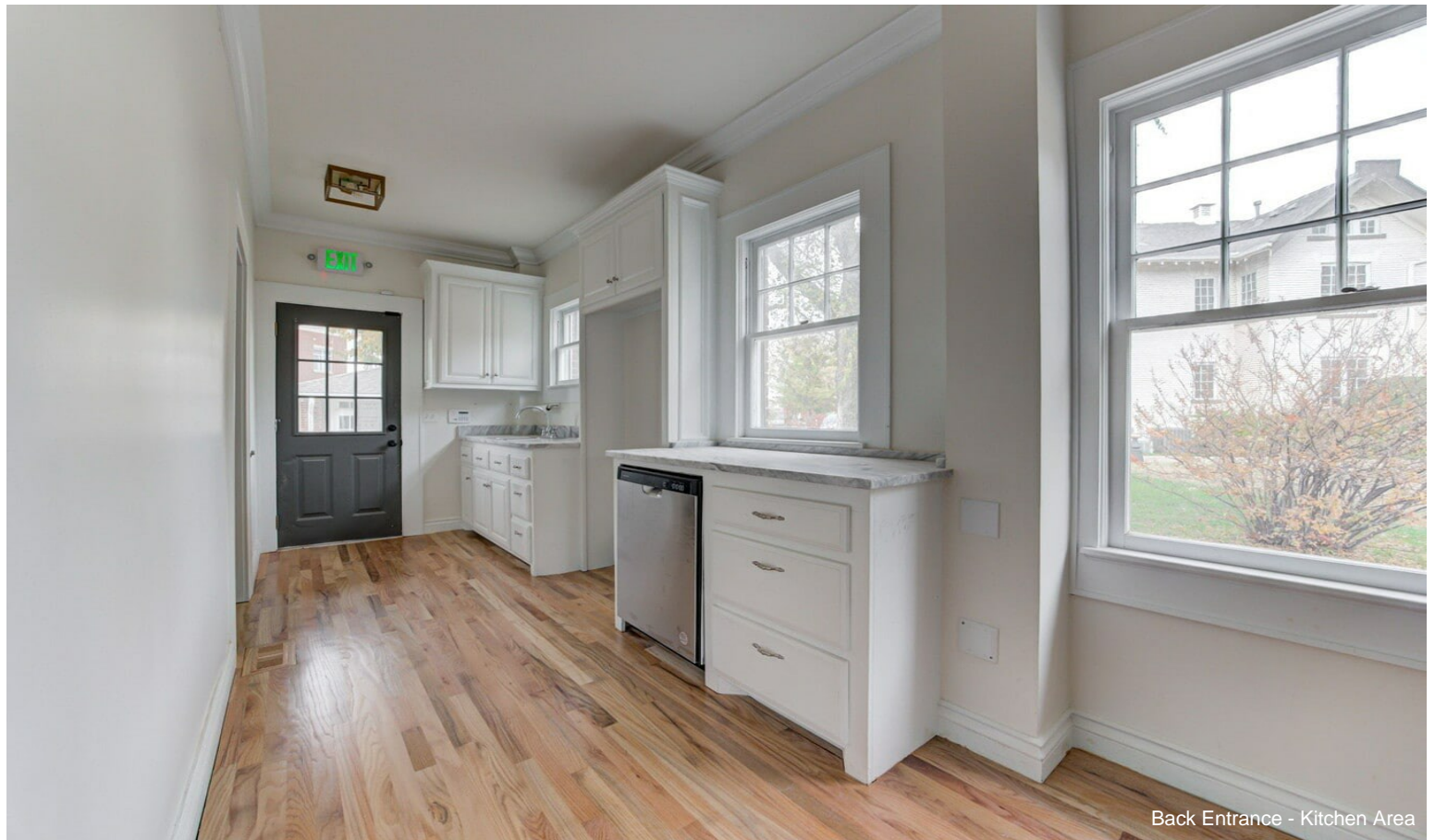
Back Entrance - Kitchen Area