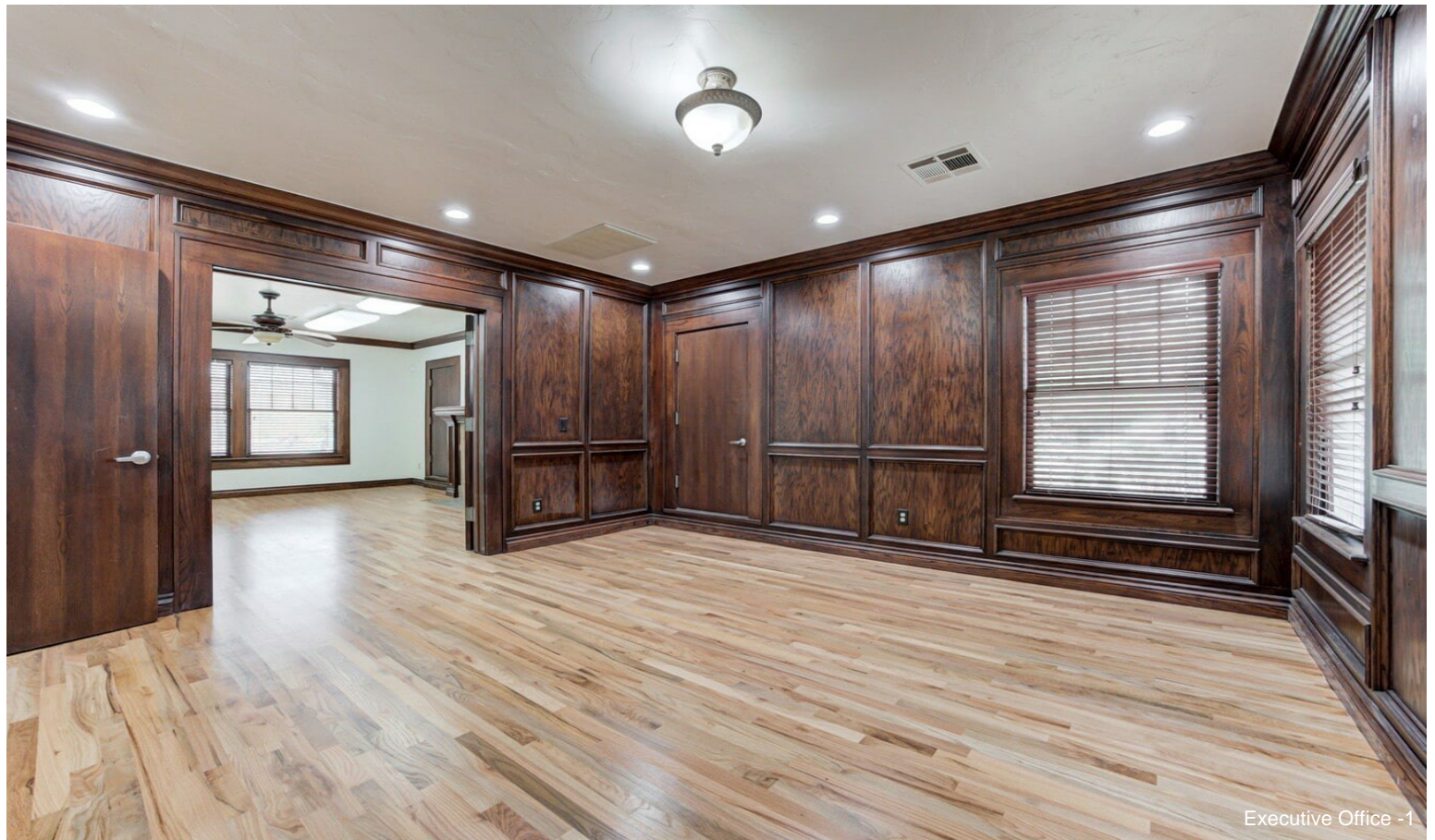
Executive Office -1