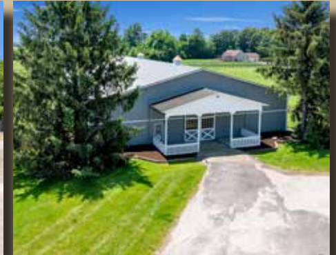
Exterior of Barns & Indoor Arena