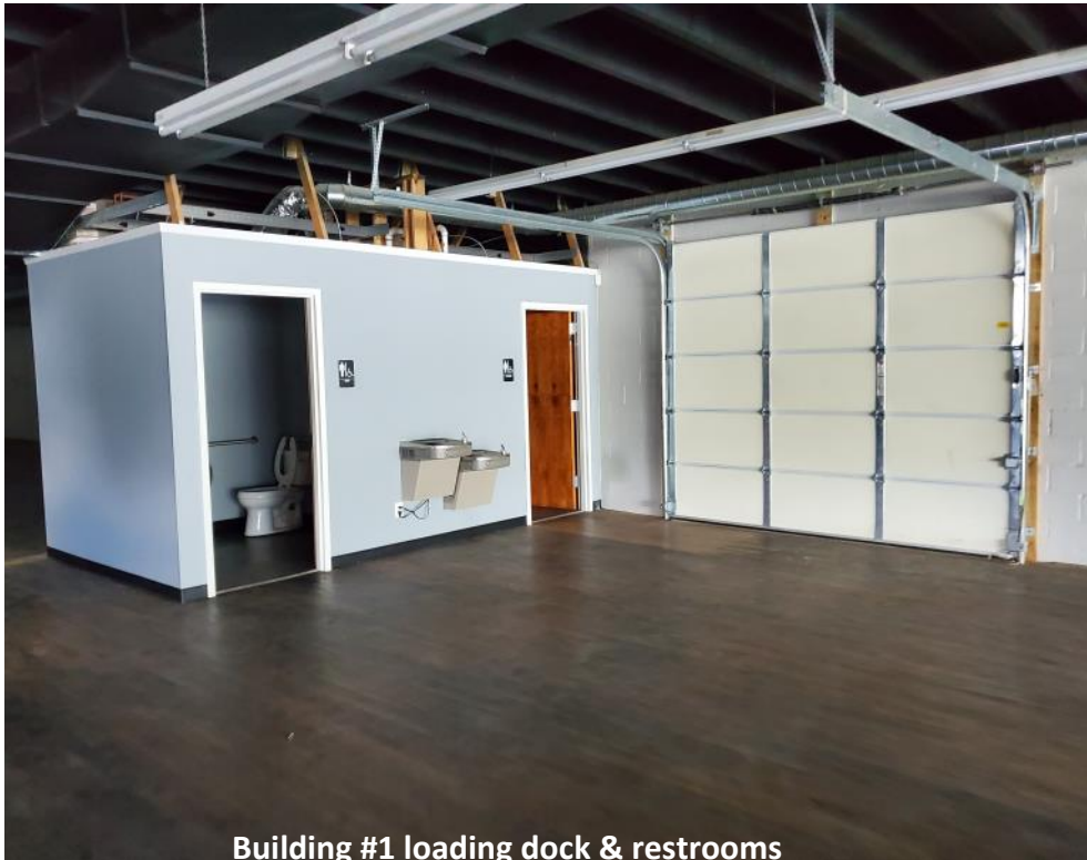
Building #1 loading dock & restrooms