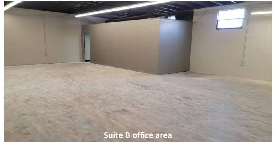
Suite B office area