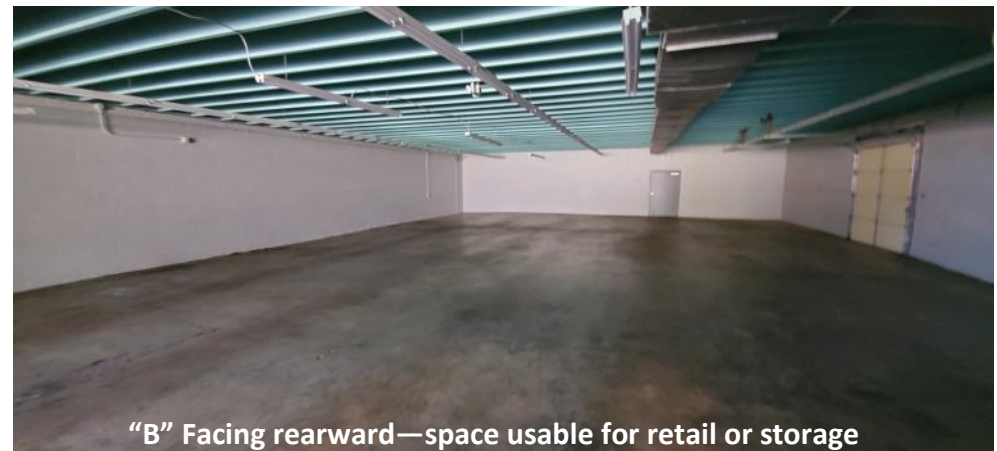
"B" Facing rearward—space usable for retail or storage