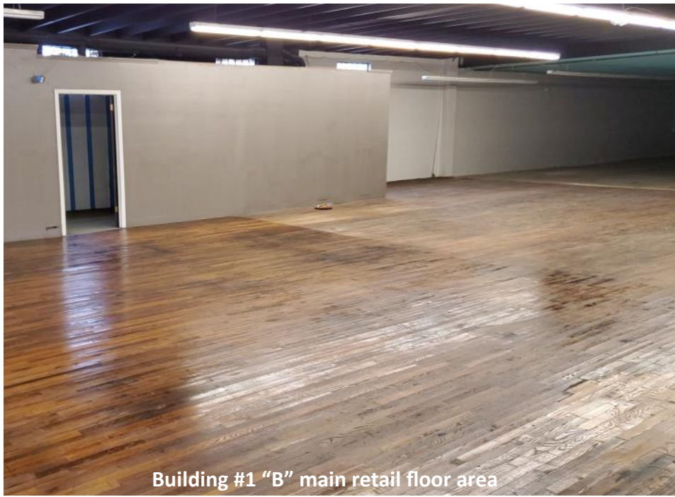
Building #1 "B" main retail floor area

Gross Leasable Area: 8,000 SF in building #1 (Suite B has 5,092 SF currently available)