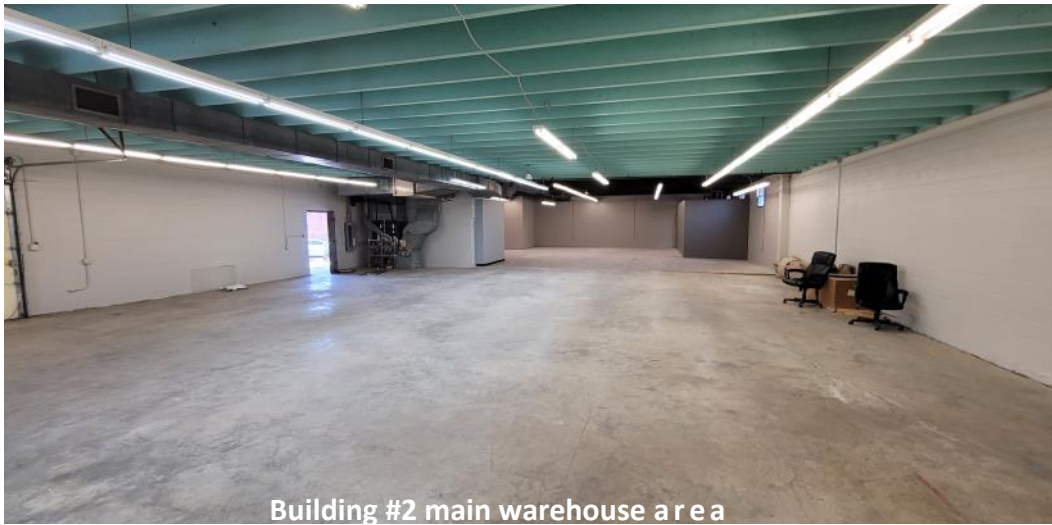
Building #2 main warehouse area