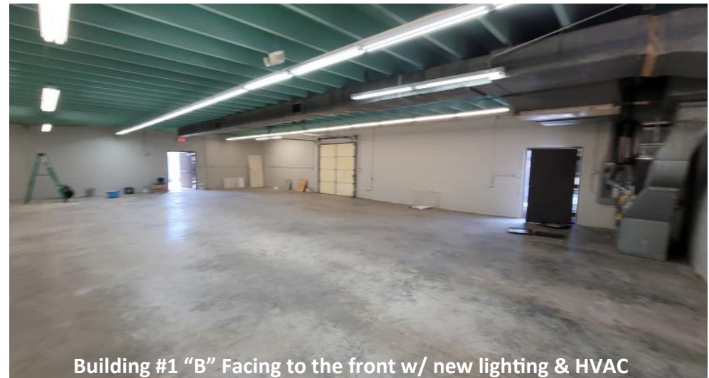
Building #1 "B" Facing to the front w/ new lighting & HVAC