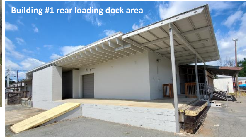
Building #1 rear loading dock area