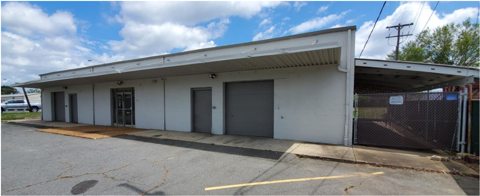
Building #2 main entrance (fully leased)