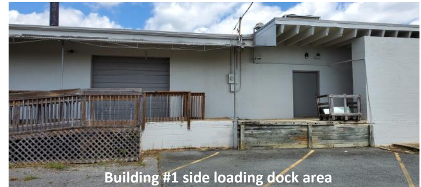
Building #1 side loading dock area