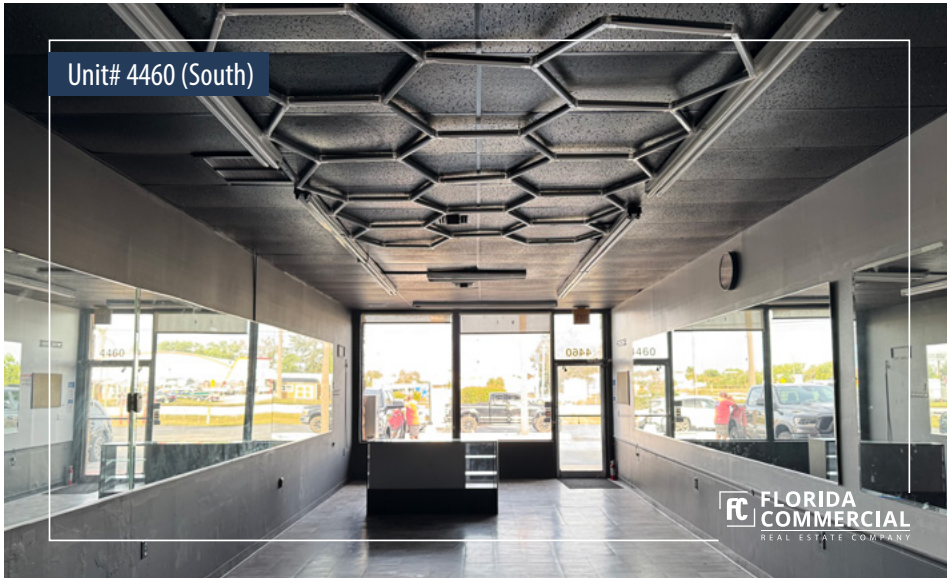
Unit# 4460 (South)

FC FLORIDA COMMERCIAL REAL ESTATE COMPANY