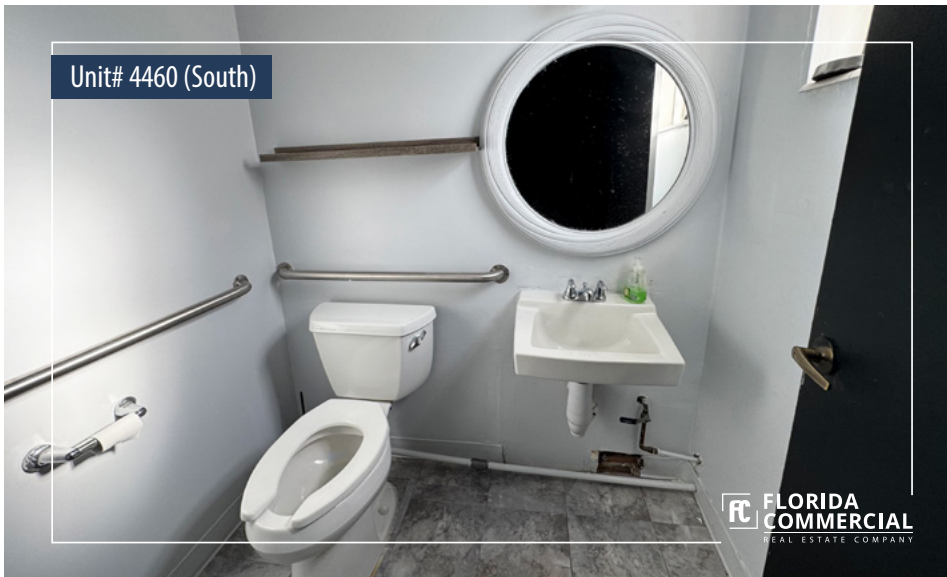
Unit# 4460 (South)

FC FLORIDA COMMERCIAL REAL ESTATE COMPANY