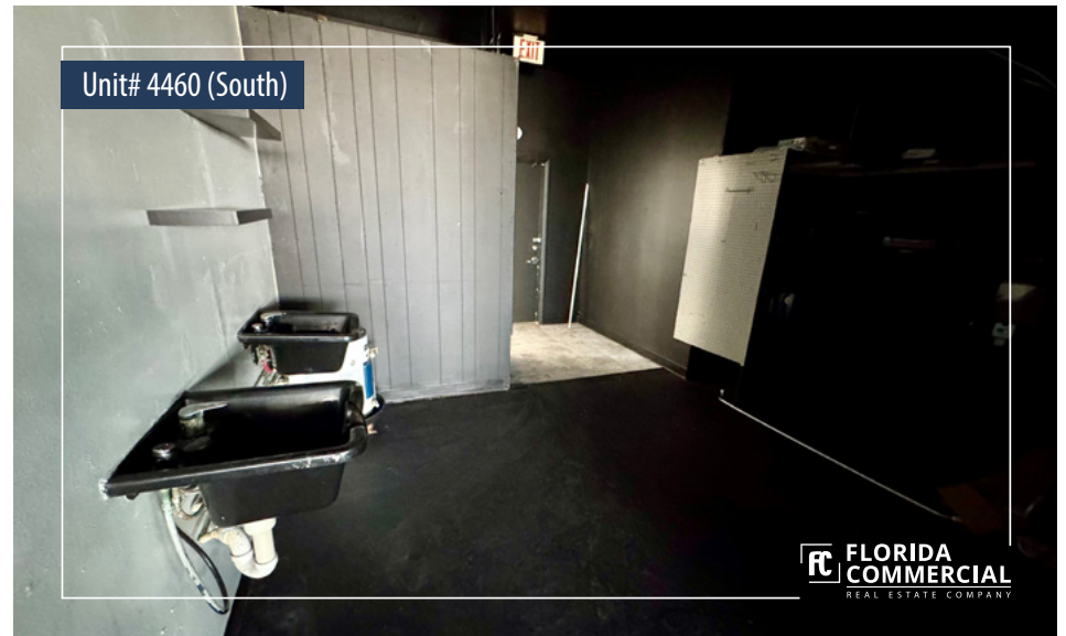
Unit# 4460 (South)

FC FLORIDA COMMERCIAL REAL ESTATE COMPANY