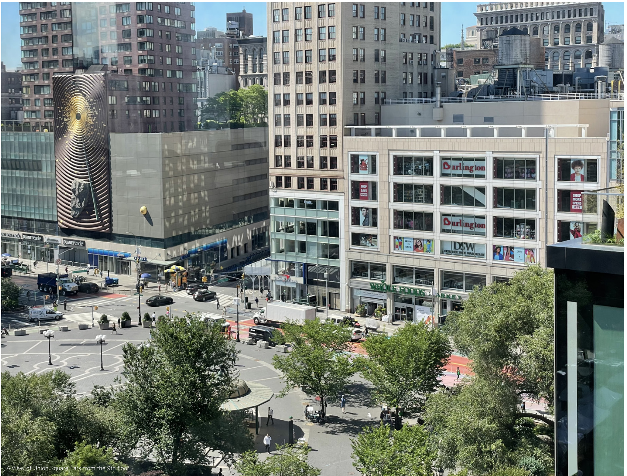
A View of Union Square Park from the 9th floor