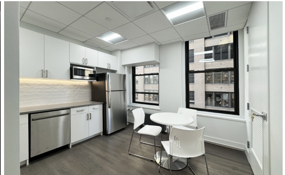
Sample Pantry Finishes