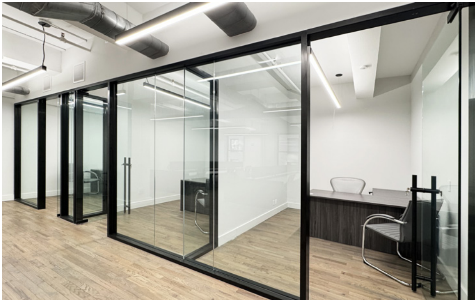
Sample Glass-Front Finishes

(Floor plan for descriptive purposes only; not to scale.)