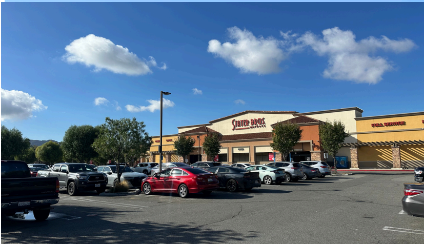
Shopping center located next to the property