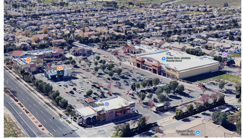
Aerial Shot of said shopping center