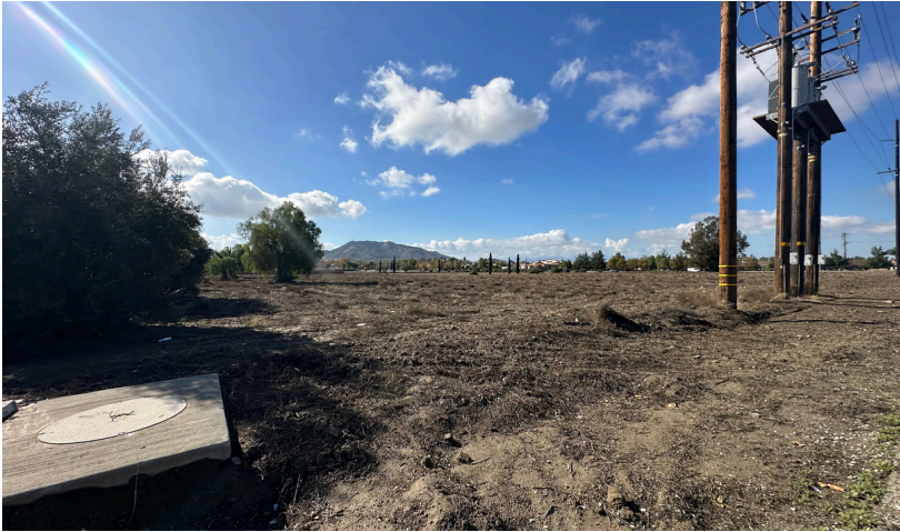
Northern Side facing southwest