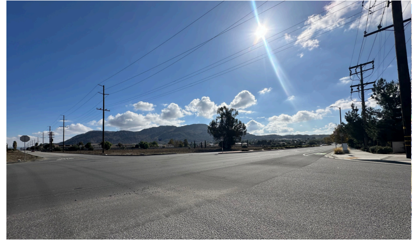
North west corner facing east