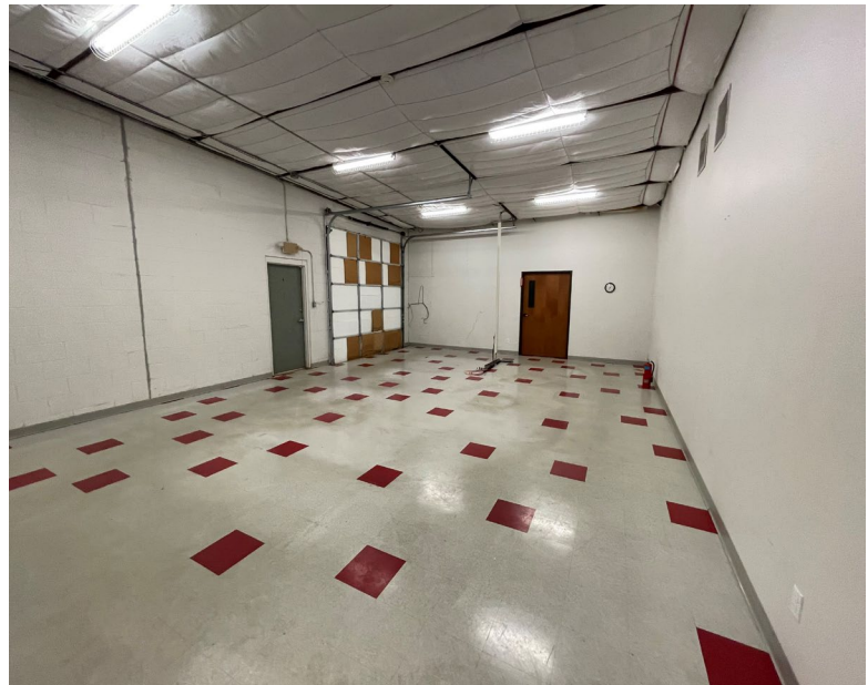
Air-conditioned production space