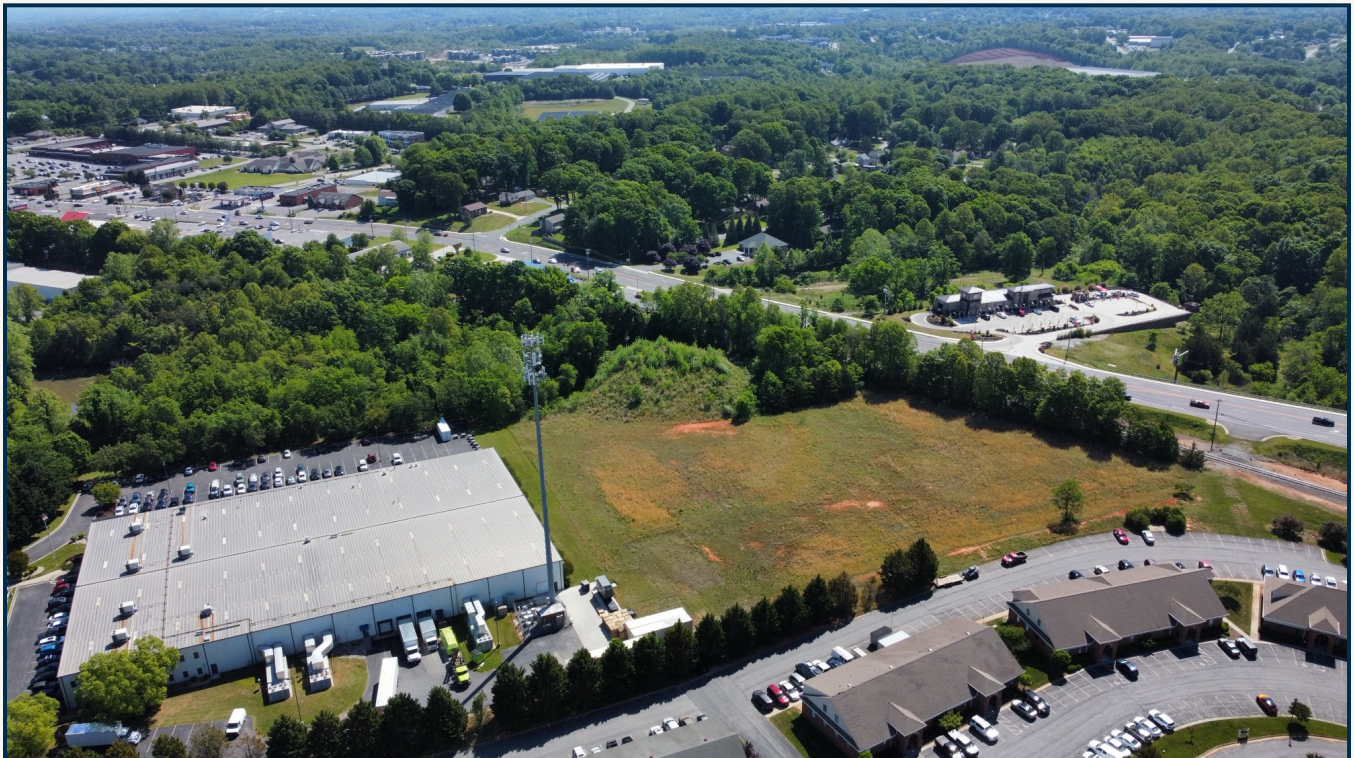
Aerial perspective of the site and surrounding industrial and commercial context.