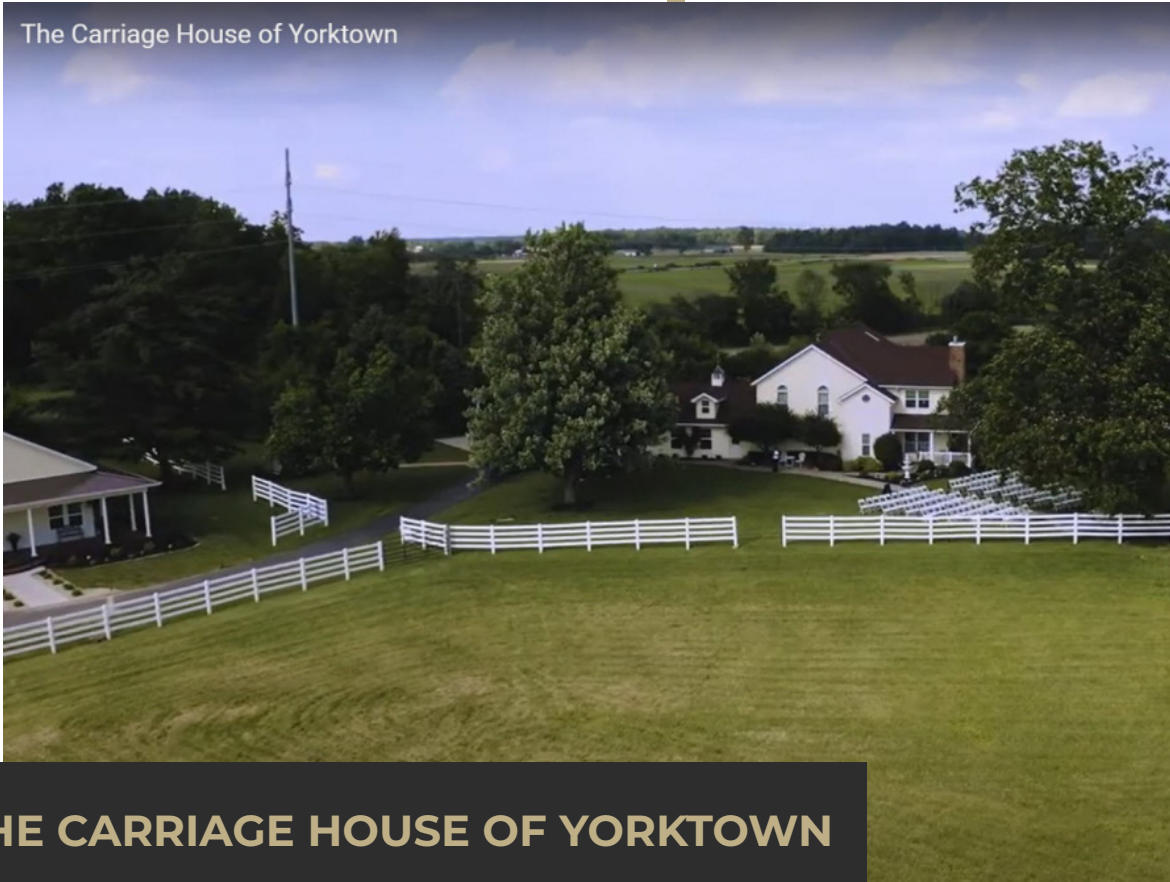
The Carriage House of Yorktown