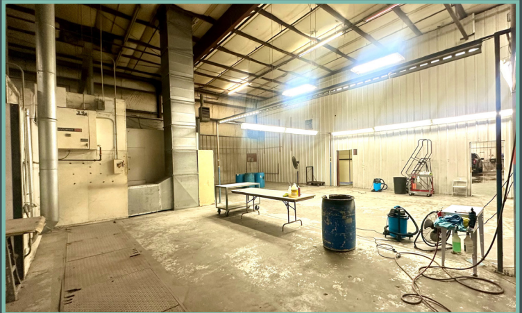
Various Work Layouts