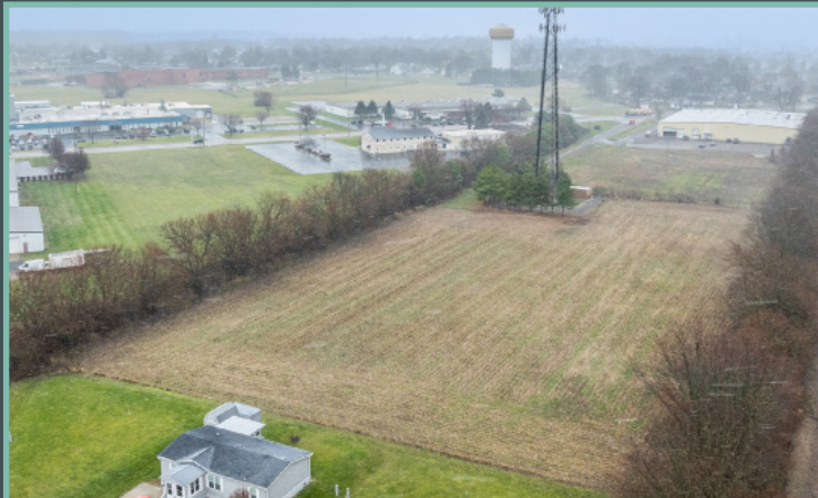
Optional Excess Acreage Available (not included with the sale of the building)