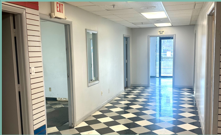
Guest Service Lobby