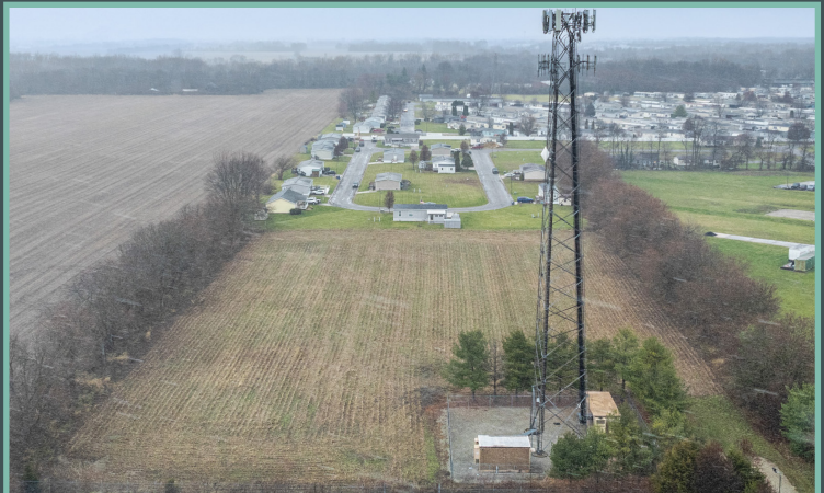
Cell Tower with Income on Excess Acreage