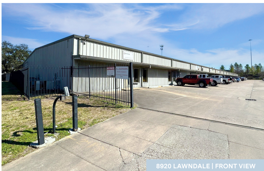
8920 LAWDALE | FRONT VIEW

The information contained herein has been given to us by the owner of the property or other sources we deem reliable, we have no reason to doubt its accuracy, but we do not guarantee it. All information should be verified prior to purchase or lease. ©2025 Partners. All rights reserved.