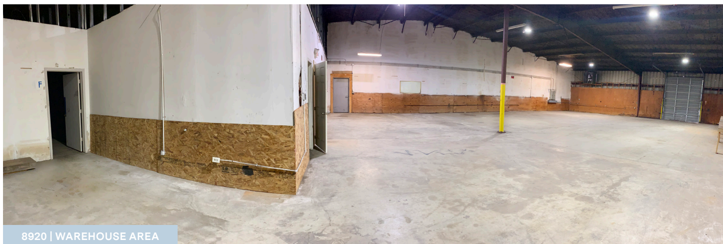
8920 | WAREHOUSE AREA