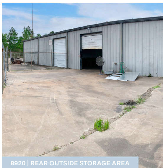
8920 | REAR OUTSIDE STORAGE AREA