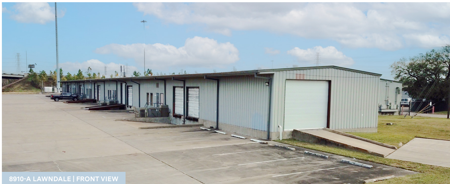
8910-A LAWDALE | FRONT VIEW