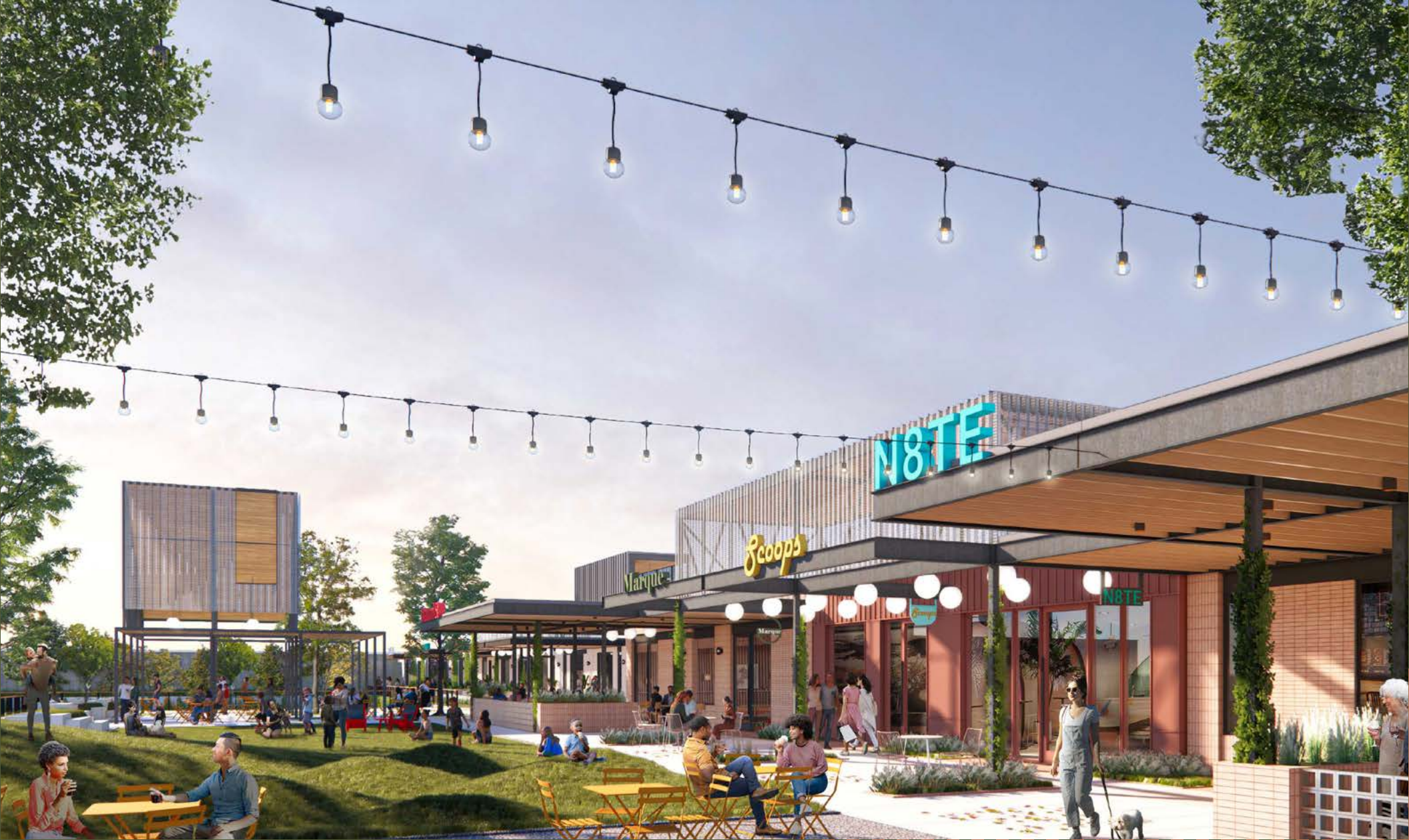
Building 2 – “The Yard”