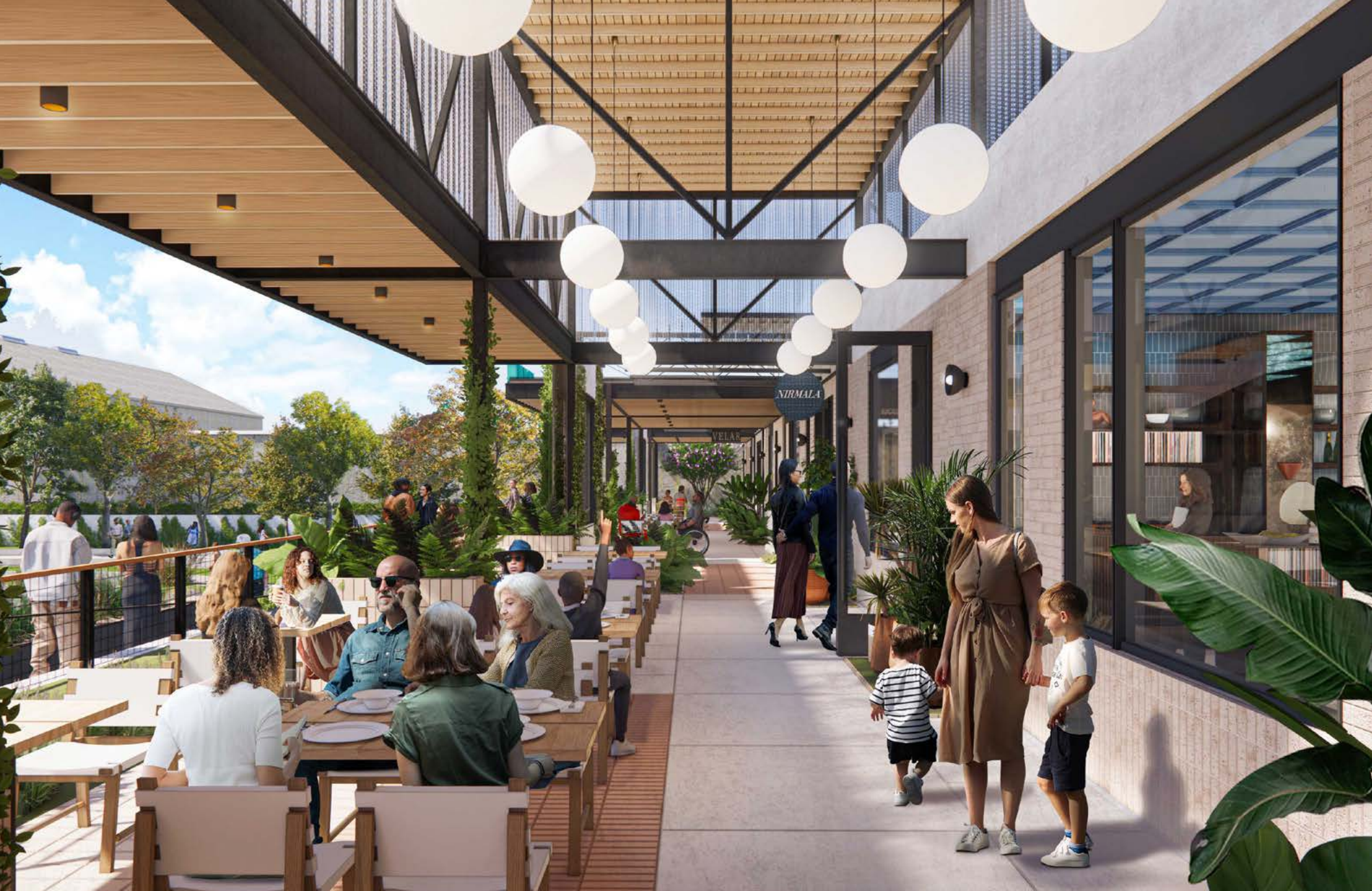
Building 3 – “The Overlook”