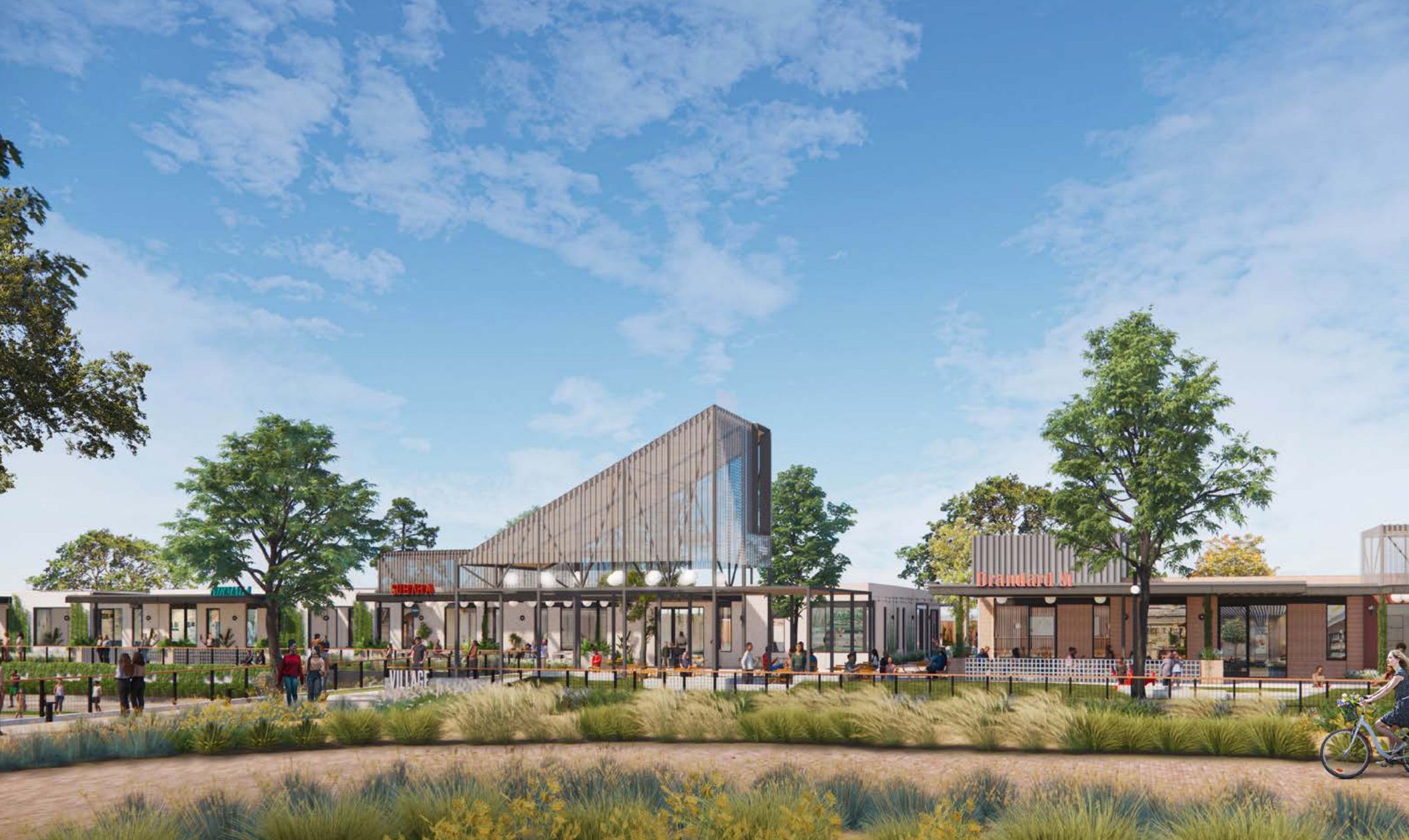
Buildings 2 & 3 – “The Pavillion”