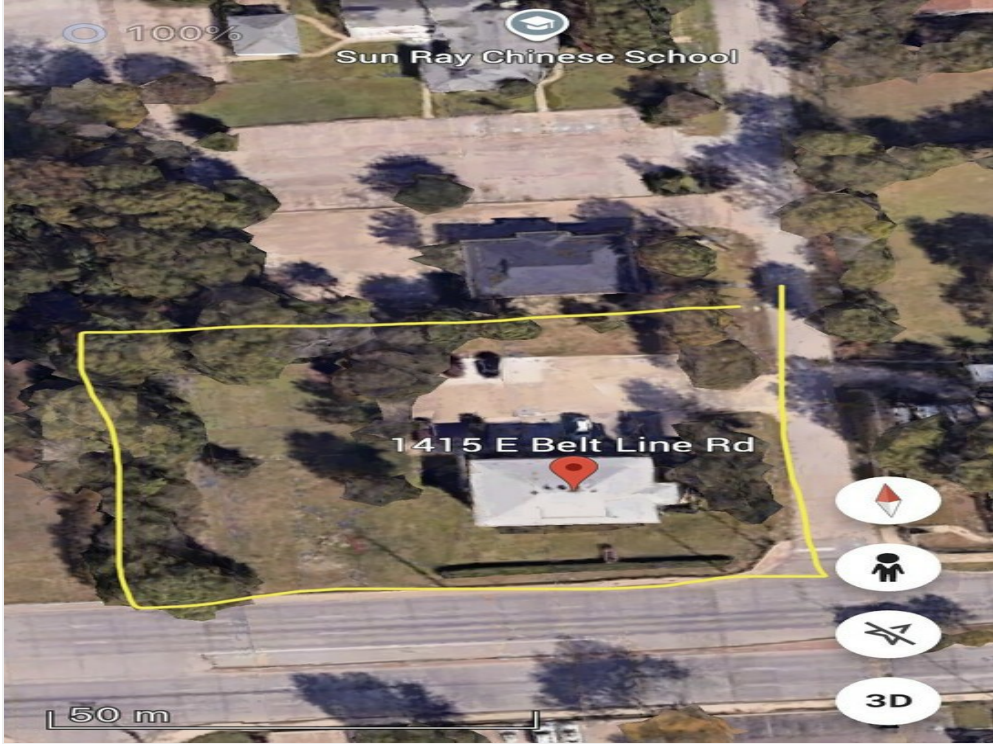
Drone Pic 1415 Beltline