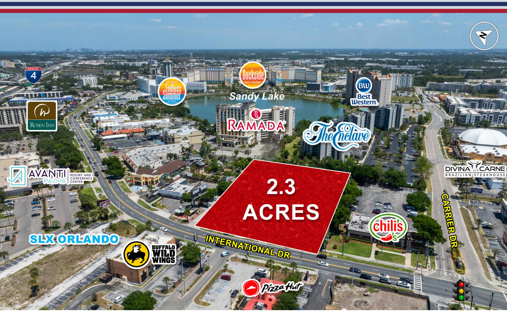
Sample Site Plan