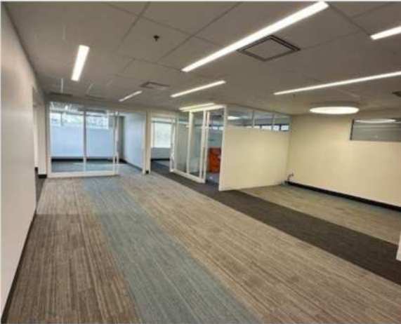
OPEN AREA FOR WORKSTATIONS / CUBICALS