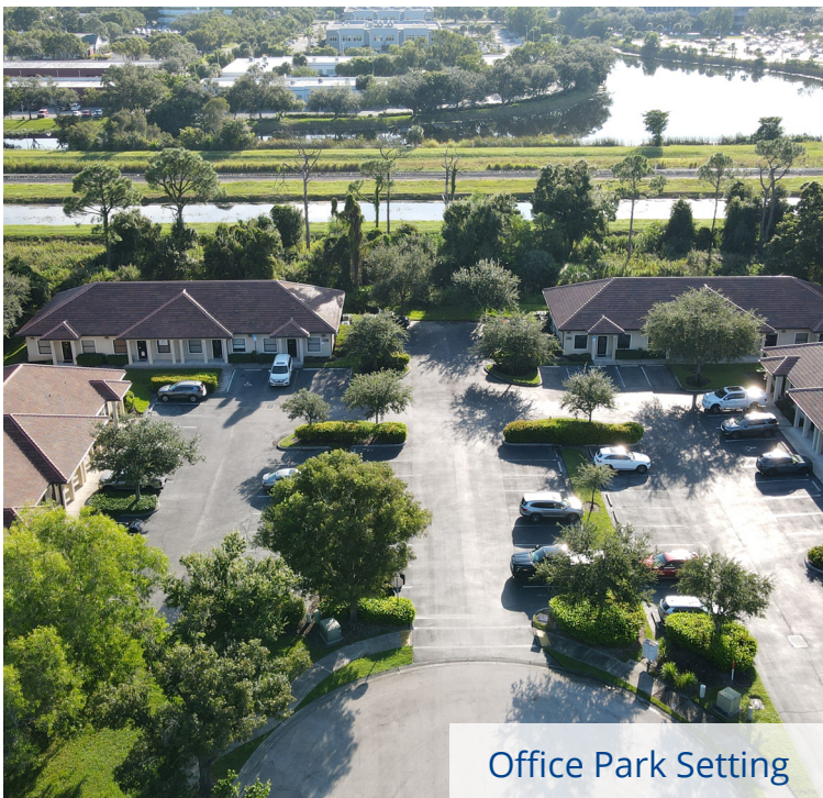
Office Park Setting