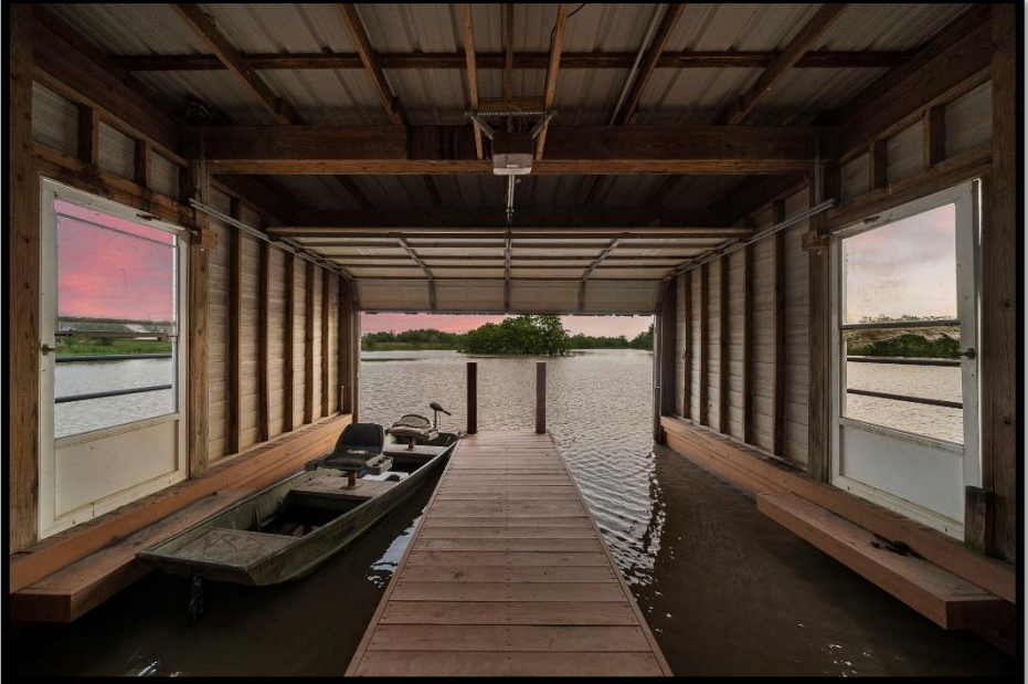
Main Lake Boat House