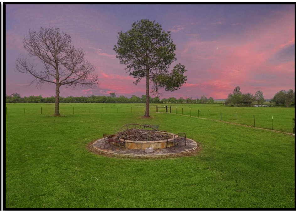
1 Acre Fishing Pond Next to House