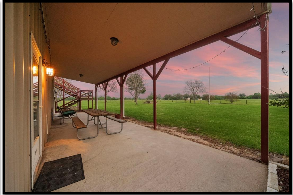
North Covered Porch