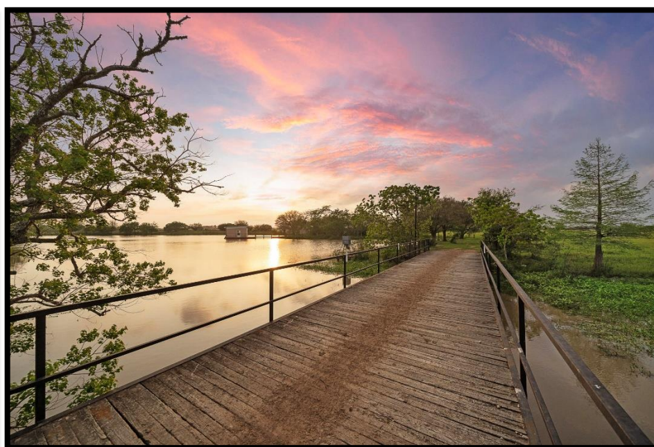
Main Lake Sitting Area