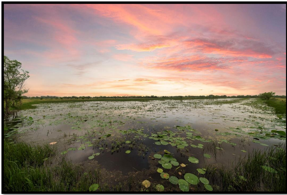
DUCK POND 1 and 2 of 3-11 Acre Ponds Each pond is planted annually and well fed so draining and re-filling is not an issue.