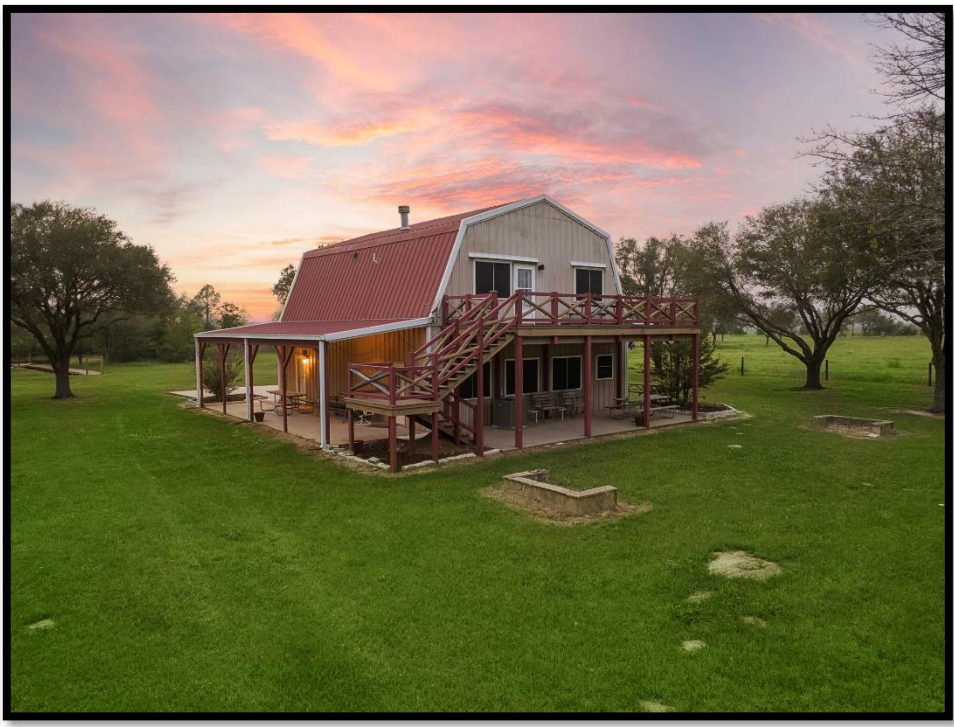
Skeet Shooting Range / View of Home From Skeet Shooting Station