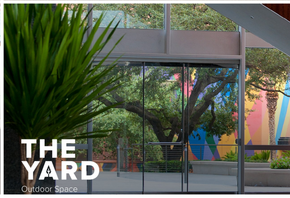
THE YARD Outdoor Space