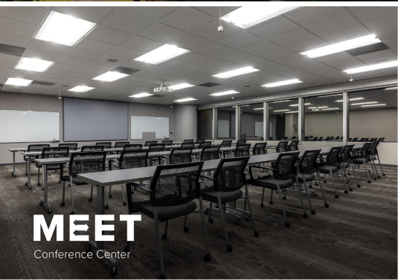
MEET Conference Center

Granite WESLAYAN TOWER 24 GREENWAY PLAZA