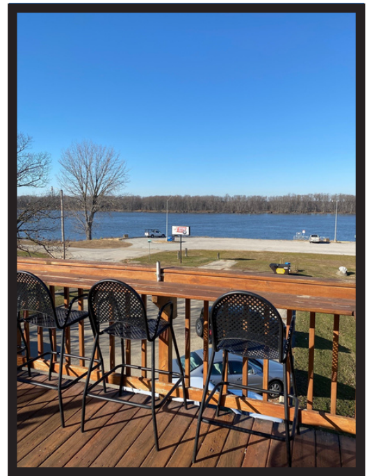
Rooftop Deck River View