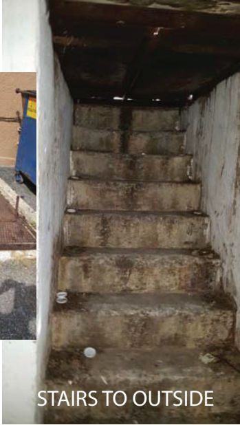
STAIRS TO OUTSIDE