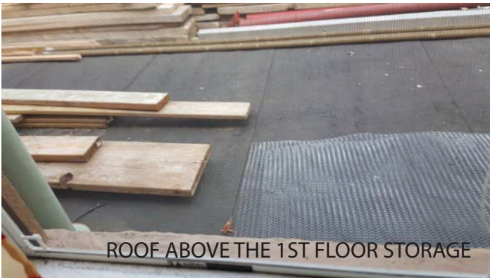
ROOF ABOVE THE 1ST FLOOR STORAGE