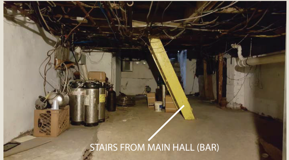
STAIRS FROM MAIN HALL (BAR)