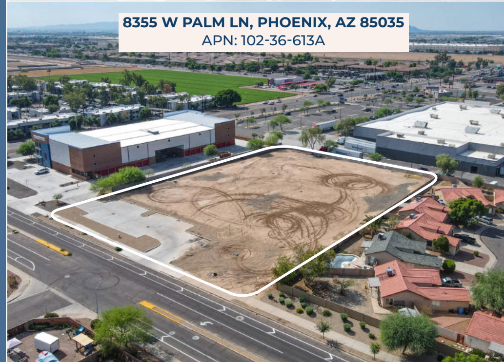
8355 W PALM LN, PHOENIX, AZ 85035 APN: 102-36-613A