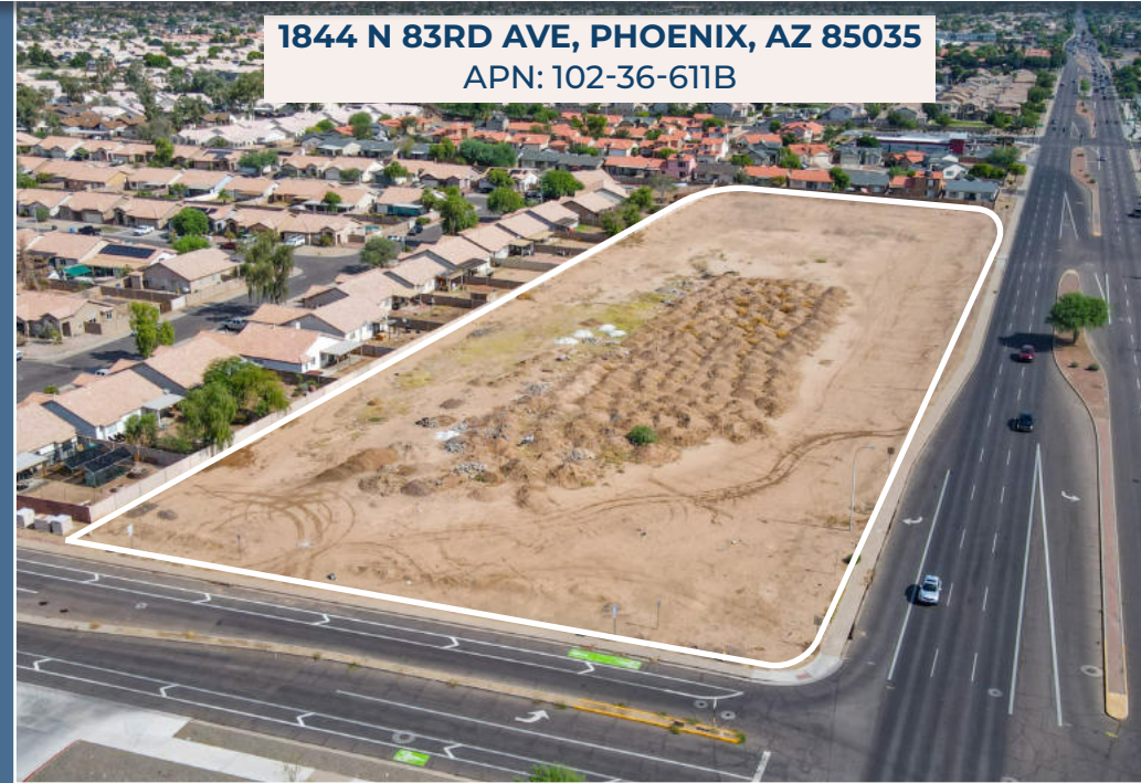
1844 N 83RD AVE, PHOENIX, AZ 85035 APN: 102-36-611B

Restaurants, professional offices, fitness centers, daycare, hotels, or recreational facilities.