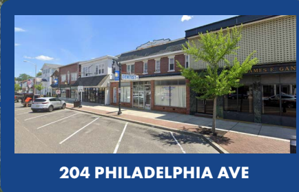
204 PHILADELPHIA AVE