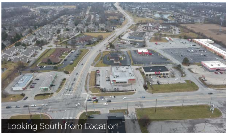
Looking South from Location