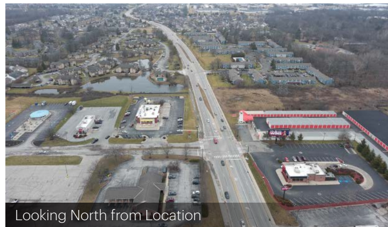
Looking North from Location