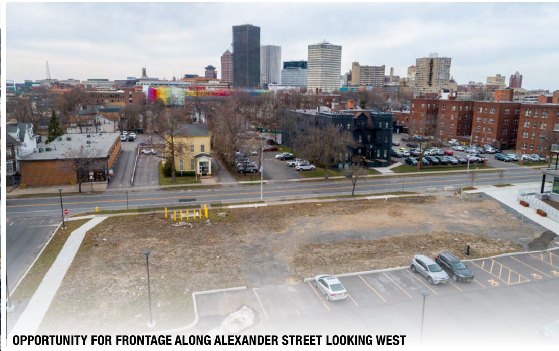
OPPORTUNITY FOR FRONTAGE ALONG ALEXANDER STREET LOOKING WEST