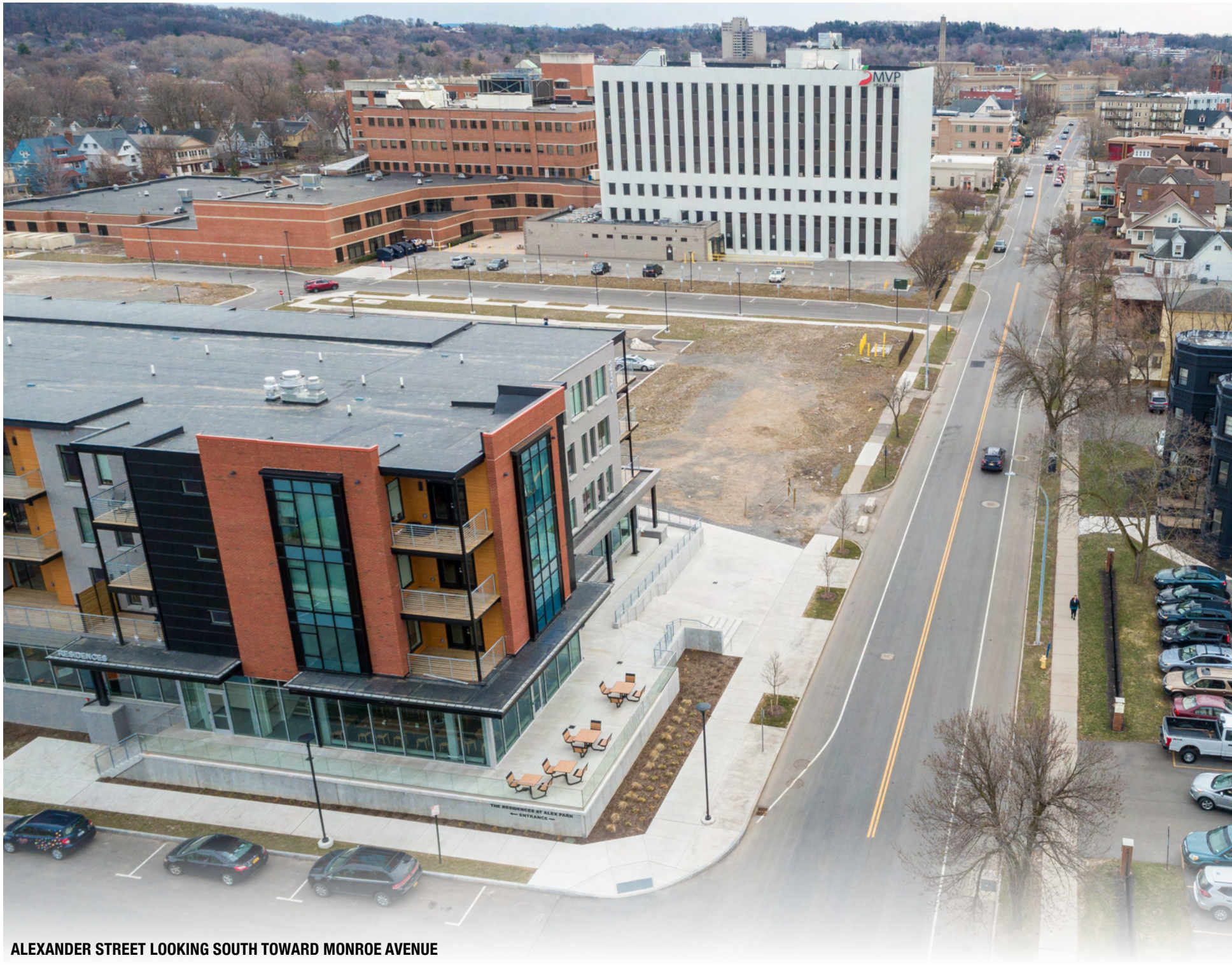
ALEXANDER STREET LOOKING SOUTH TOWARD MONROE AVENUE