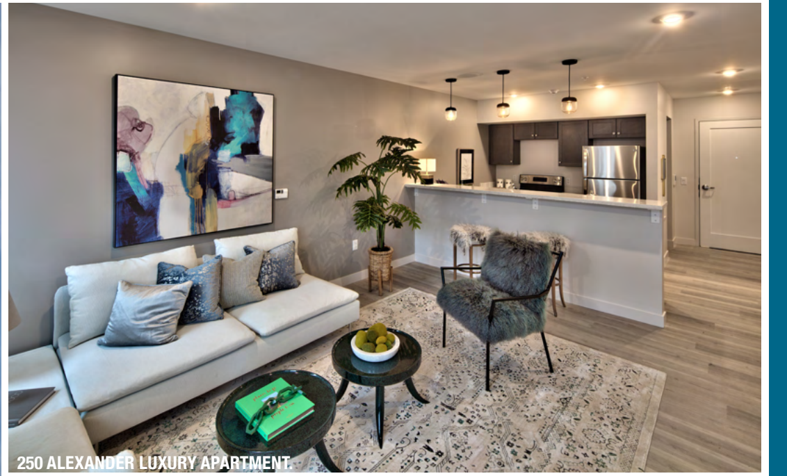
250 ALEXANDER LUXURY APARTMENT.