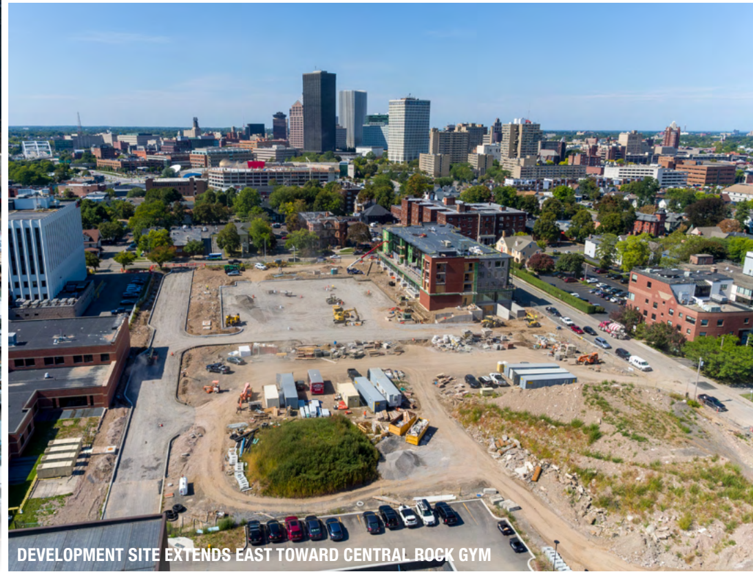
DEVELOPMENT SITE EXTENDS EAST TOWARD CENTRAL ROCK GYM