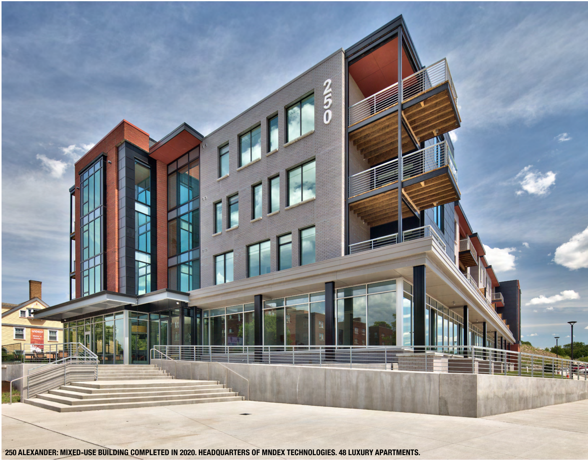
250 ALEXANDER: MIXED-USE BUILDING COMPLETED IN 2020. HEADQUARTERS OF MNDEX TECHNOLOGIES. 48 LUXURY APARTMENTS.