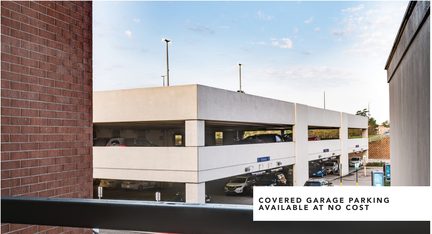
COVERED GARAGE PARKING AVAILABLE AT NO COST