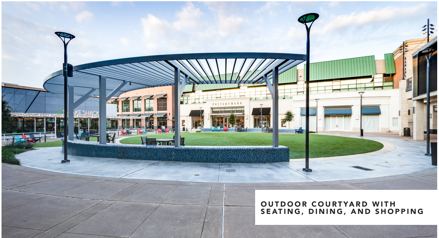
OUTDOOR COURTYARD WITH SEATING, DINING, AND SHOPPING