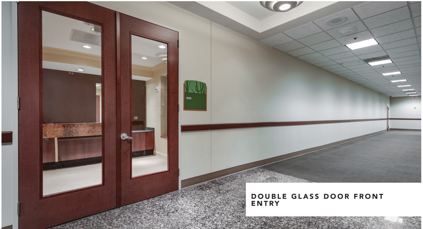
DOUBLE GLASS DOOR FRONT ENTRY