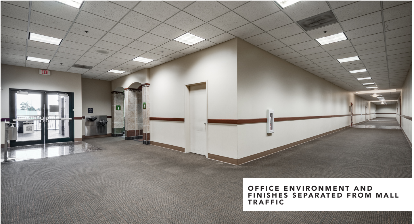
OFFICE ENVIRONMENT AND FINISHES SEPARATED FROM MALL TRAFFIC