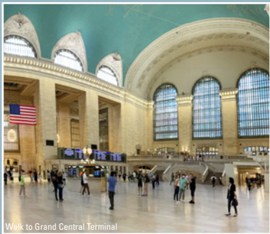
Walk to Grand Central Terminal