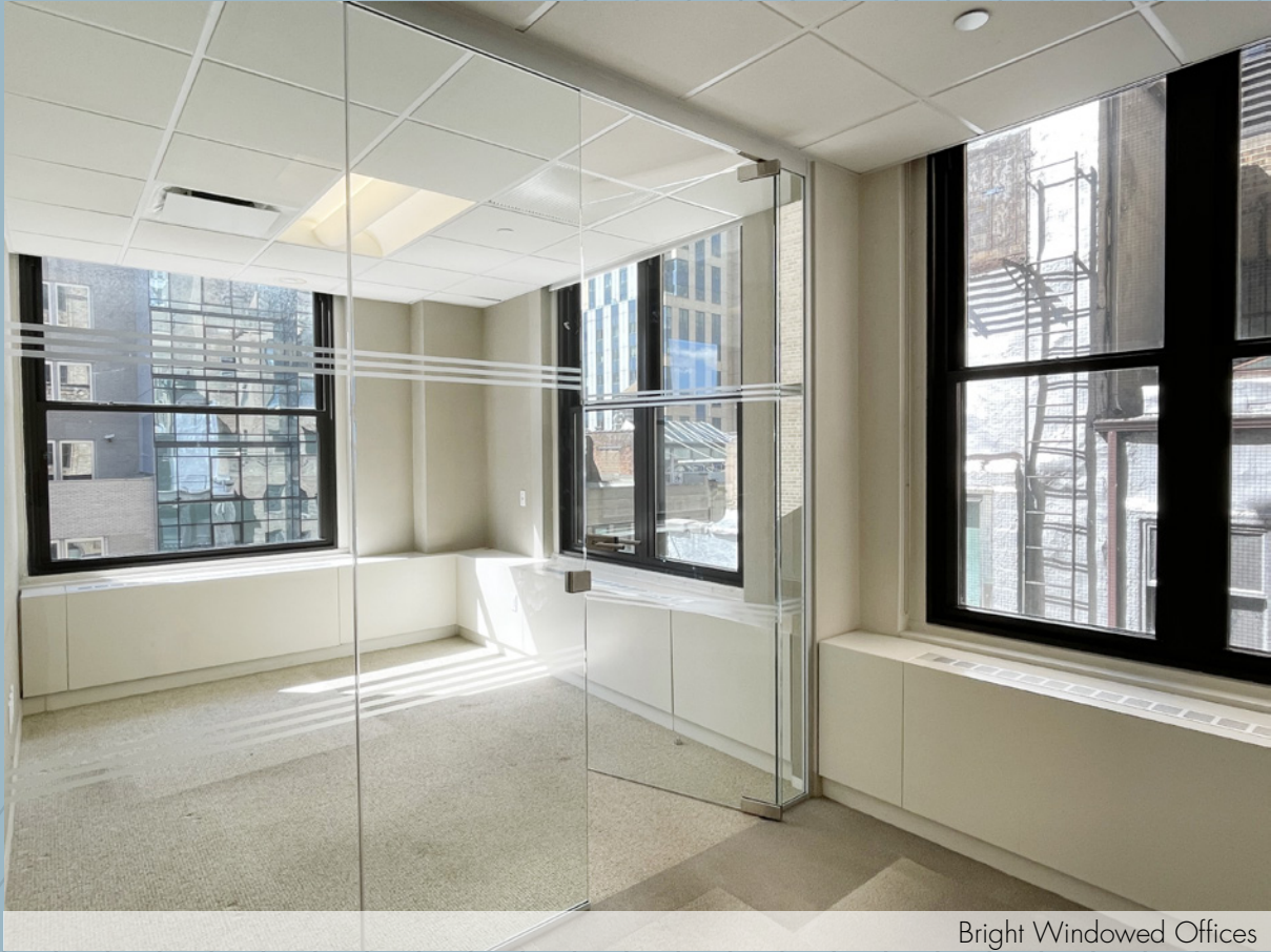
Bright Windowed Offices