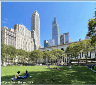
Blocks from Bryant Park