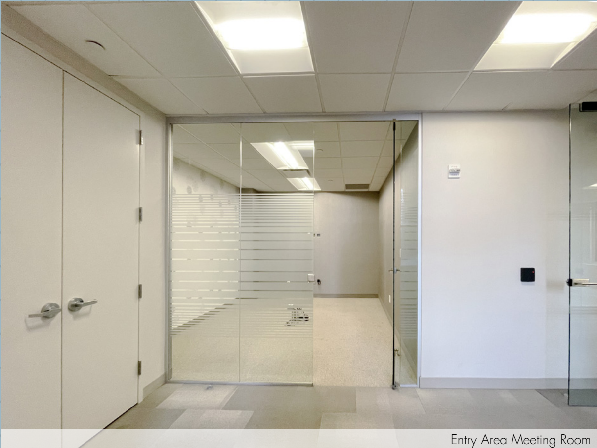
Entry Area Meeting Room