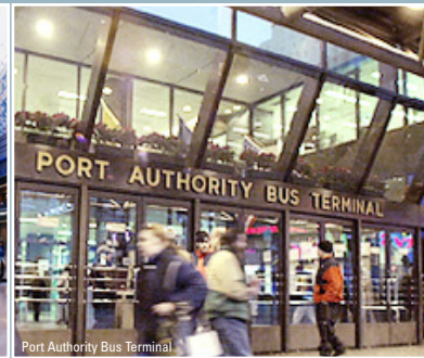
Port Authority Bus Terminal

For further information and/or inspection, please contact: