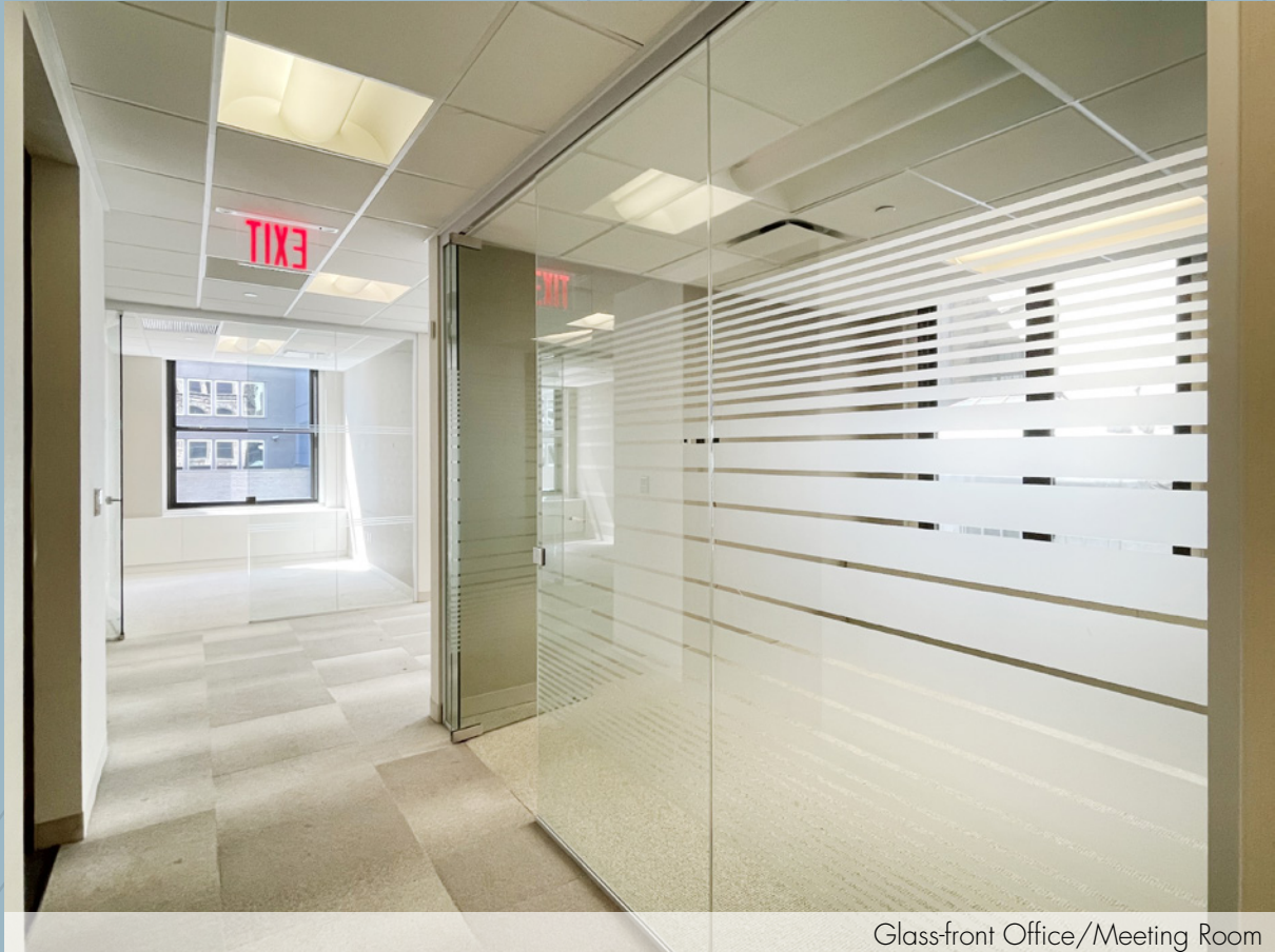
Glass-front Office/Meeting Room