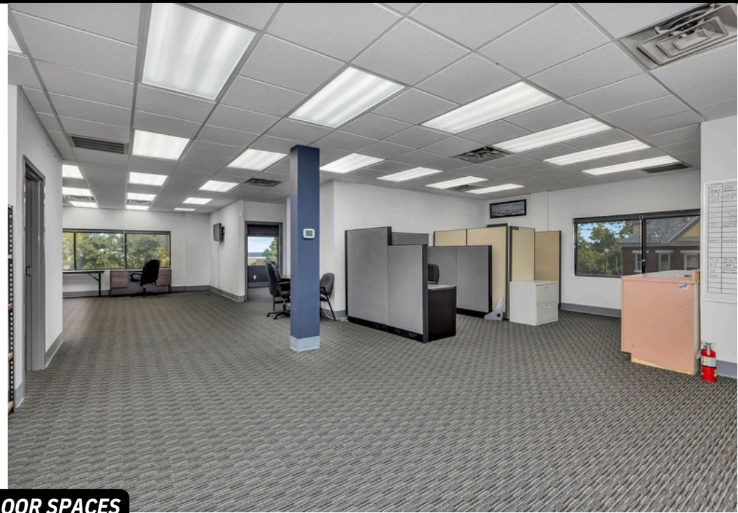
SECOND FLOOR SPACES