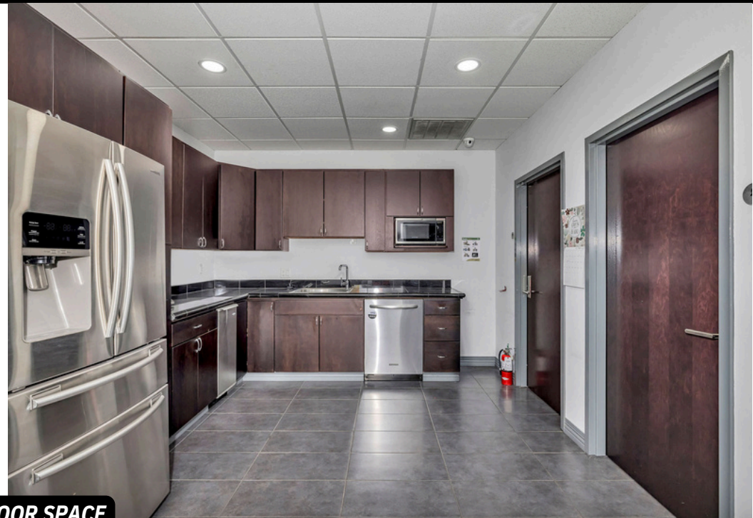
FIRST FLOOR SPACE