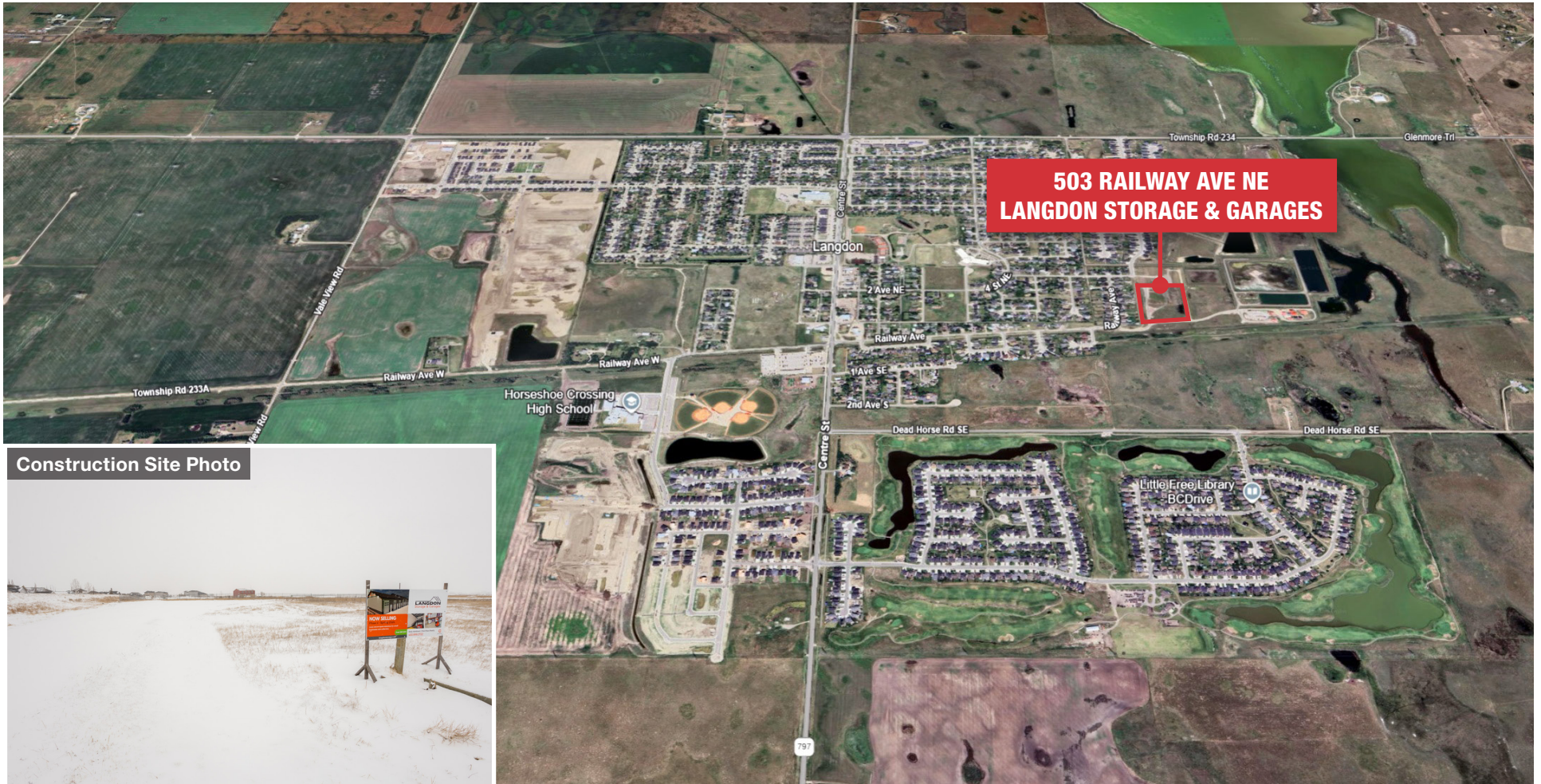
Construction Site Photo