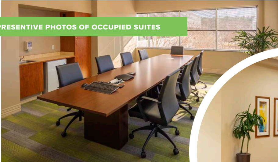
REPRESENTATIVE PHOTOS OF OCCUPIED SUITES