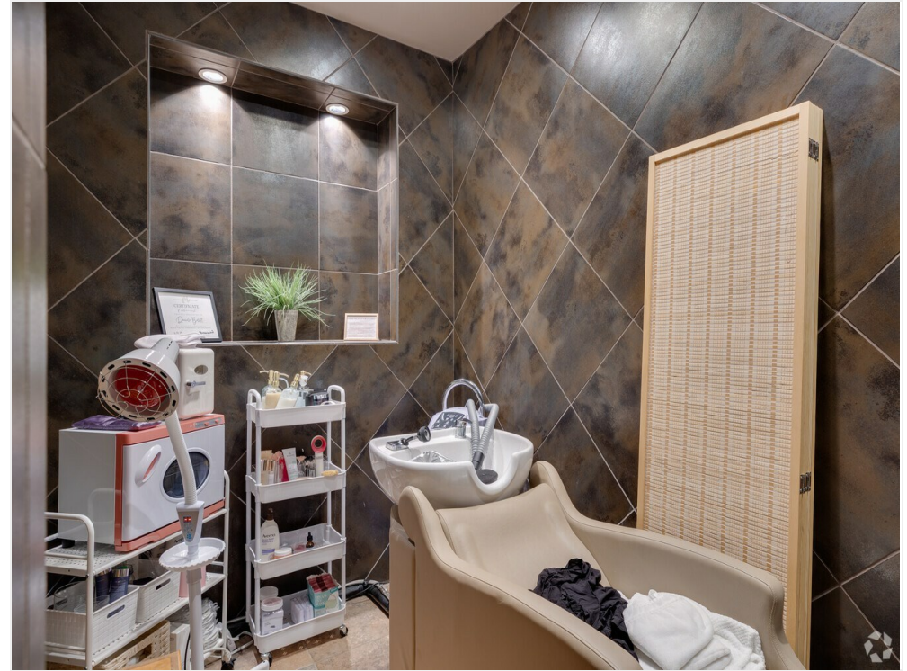
8707 S Priest Dr