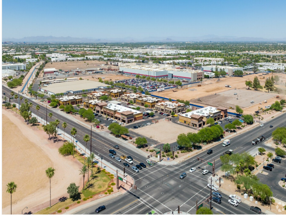
At the Corner of W Warner Road and S Priest Drive