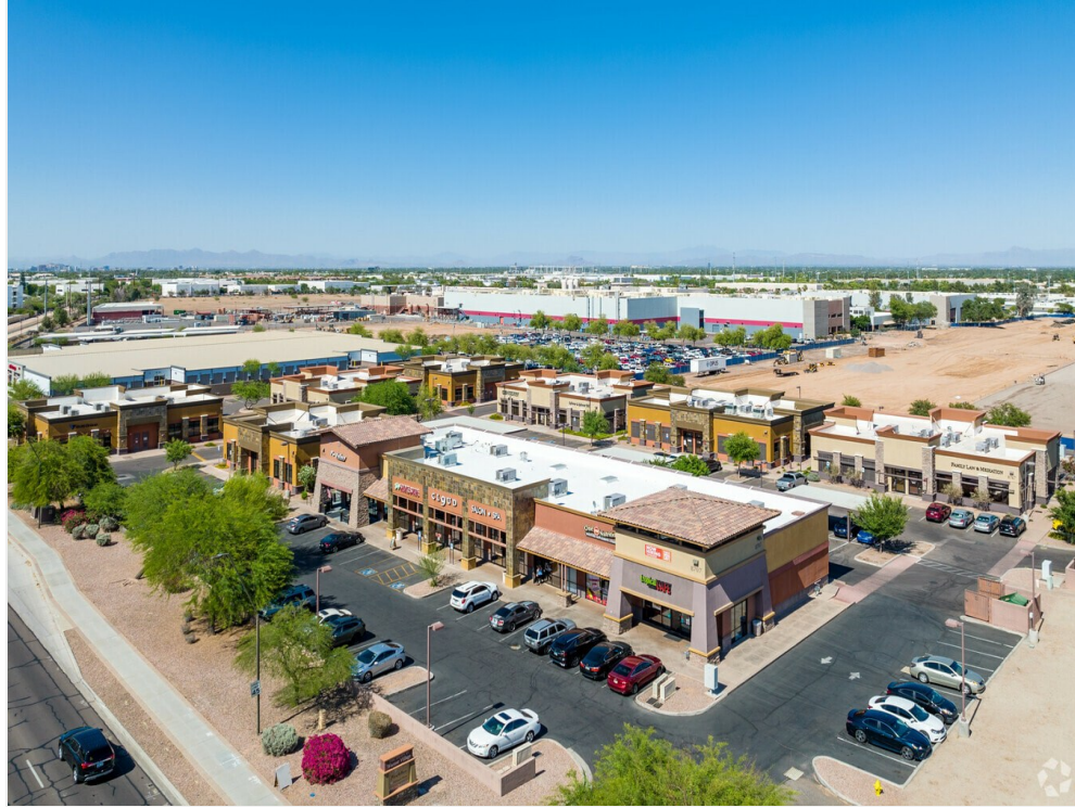
Seeing 122,700 VPD