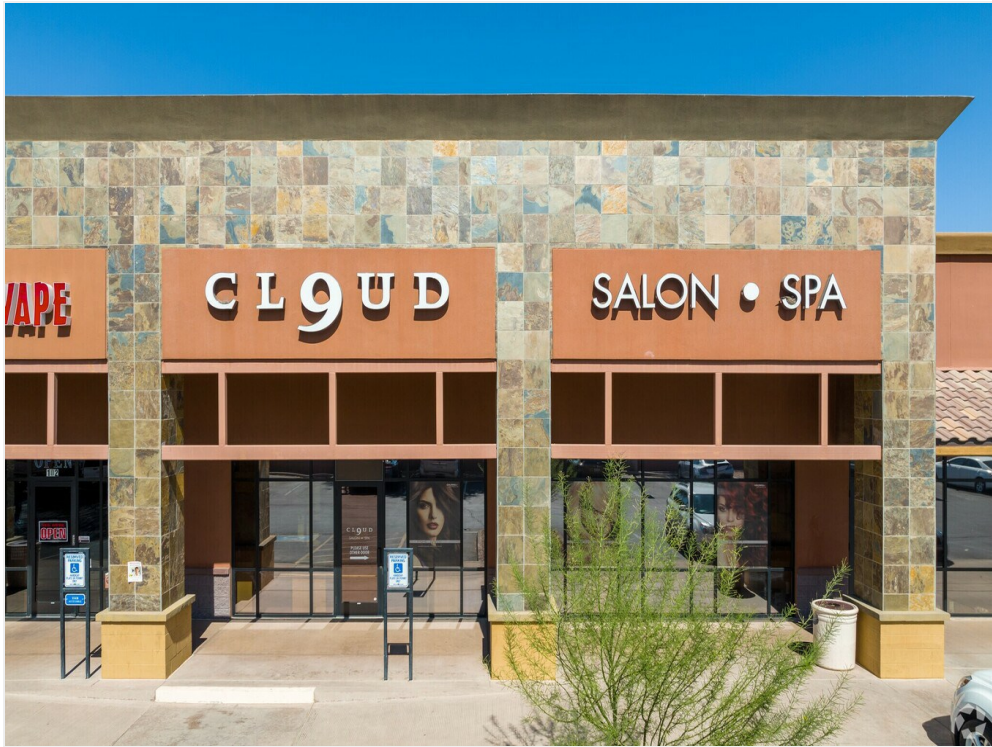
8707 S Priest Dr Suite A106