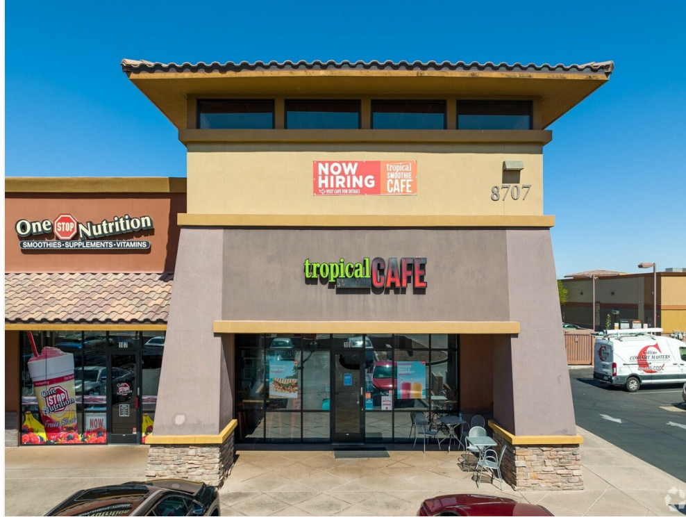
With Major Retail Anchors