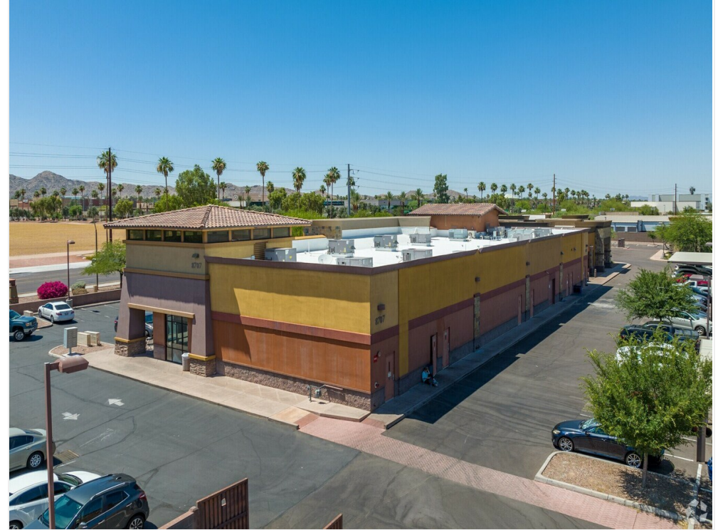
Easy Access to the Rear of the Center