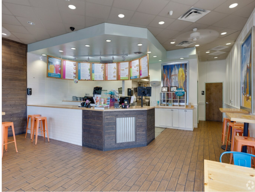
Tropical Smoothie Cafe