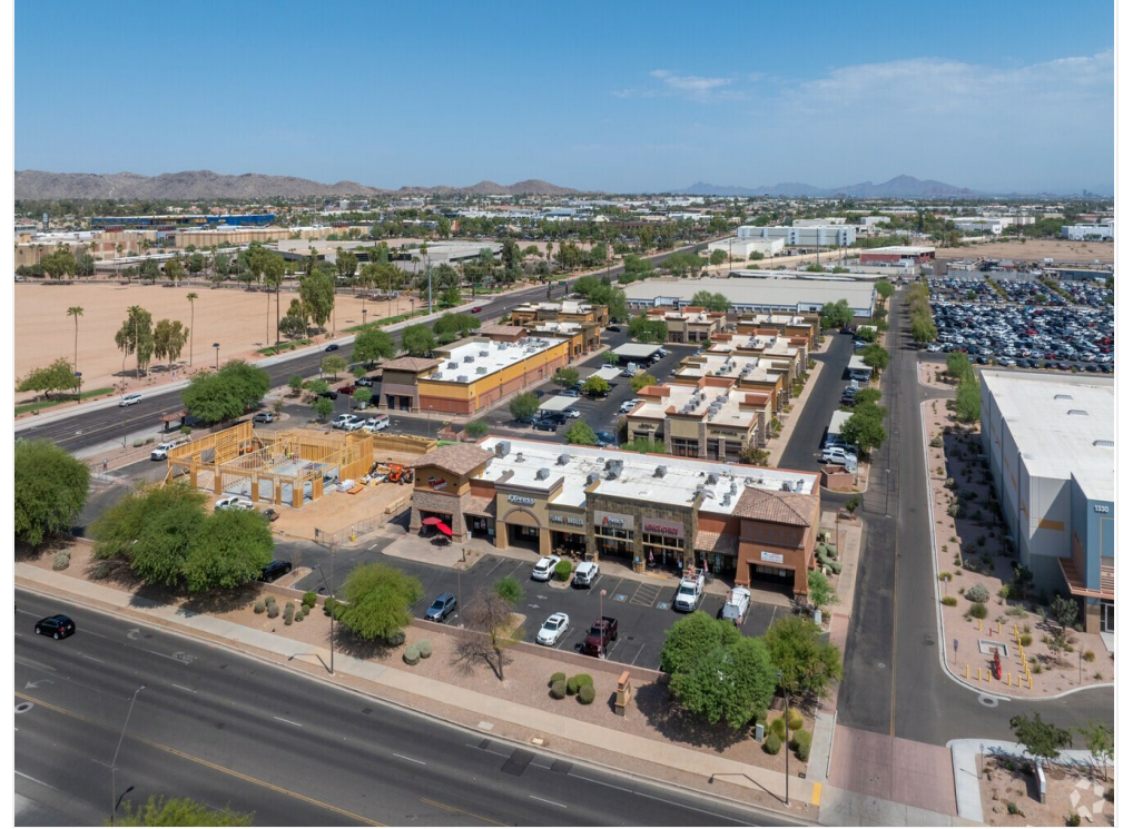
8707 S Priest Dr