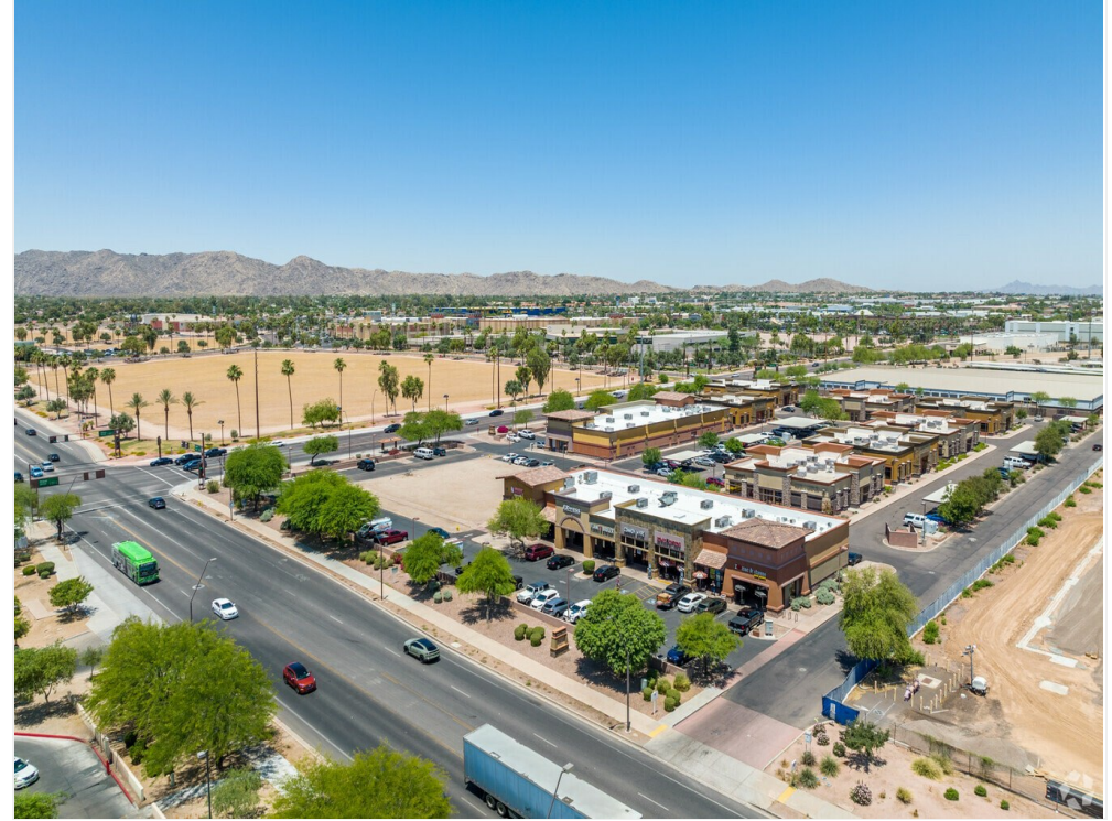
Close to Retailers