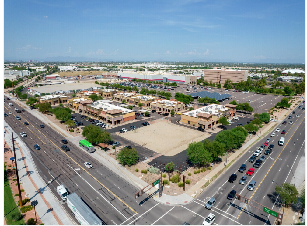
Development Opportunities on Every Corner