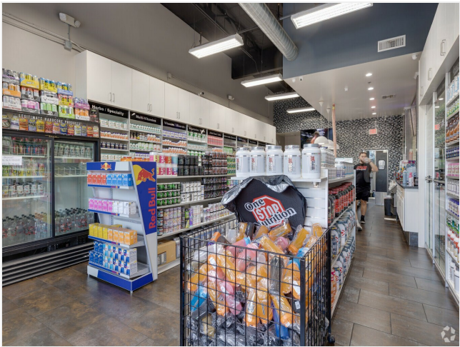
One Stop Nutrition