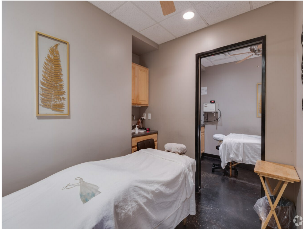
8707 S Priest Dr