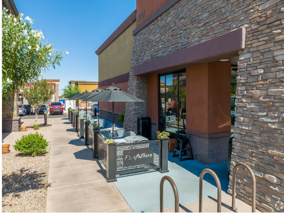
Outdoor Seating Available