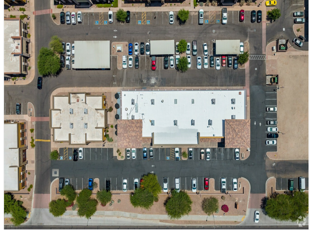
8707 S Priest Dr