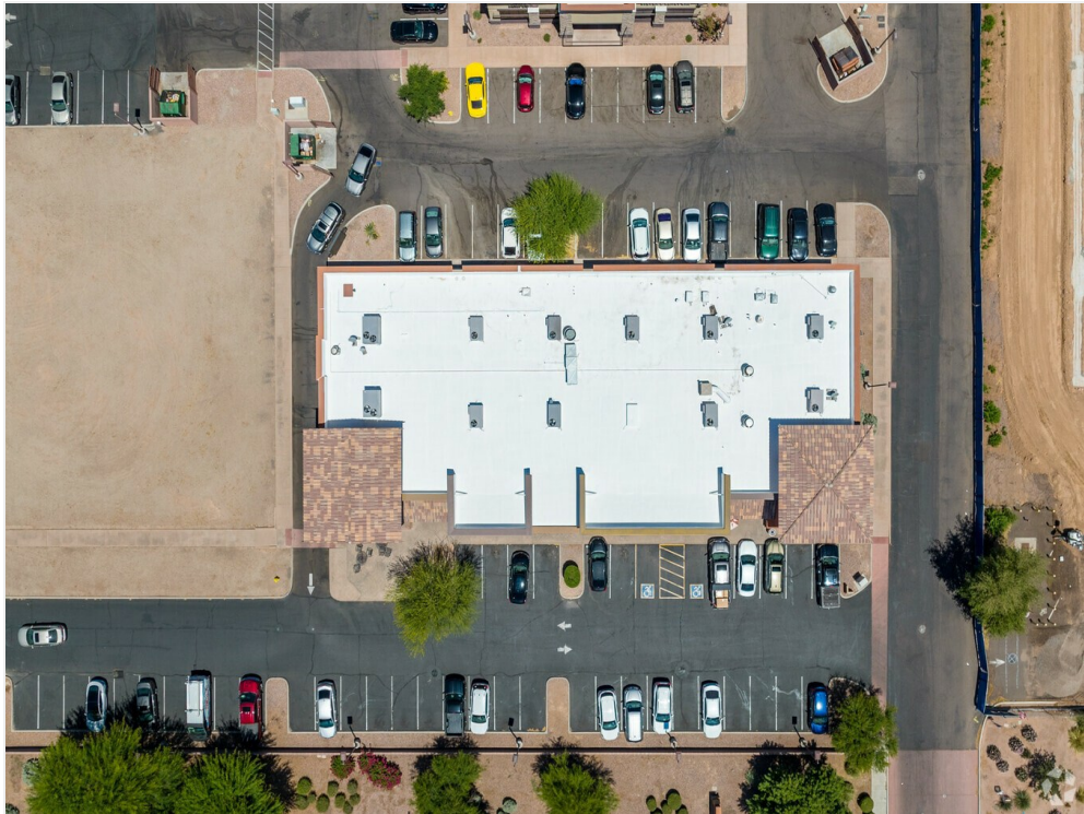
Ample Parking for Visitors and Employees