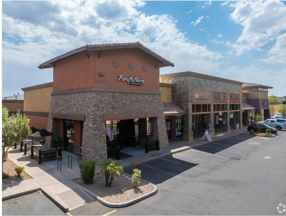
Ample Parking In Front of Suites