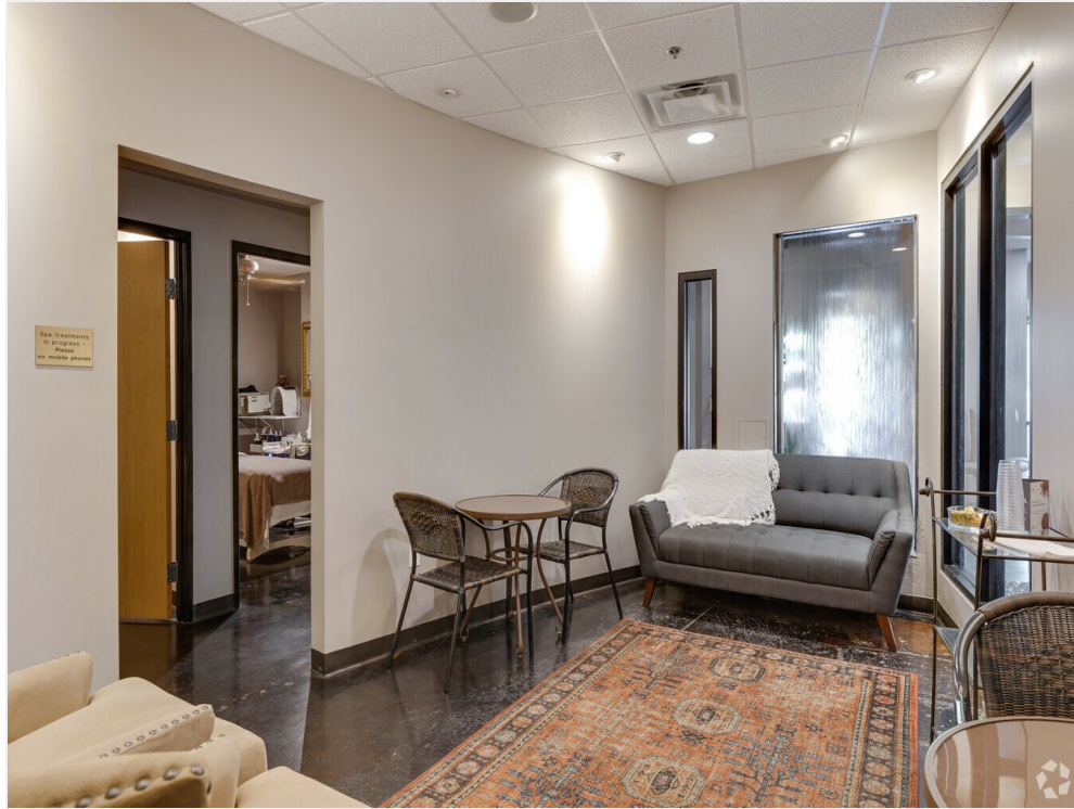
8707 S Priest Dr Suite A106