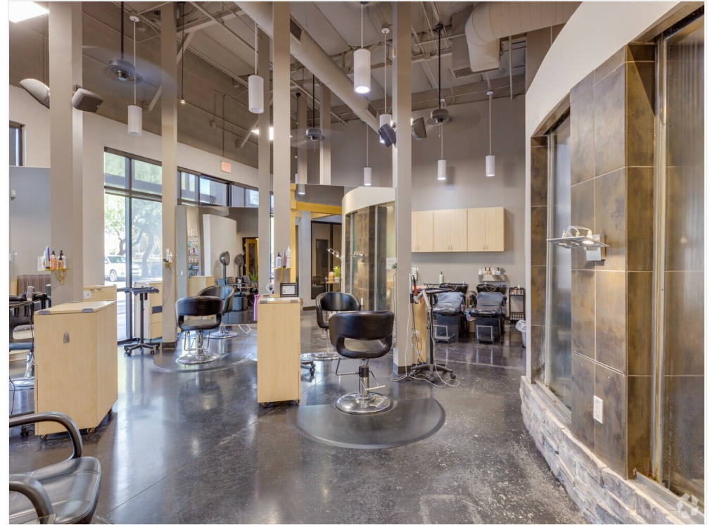
8707 S Priest Dr Suite A106