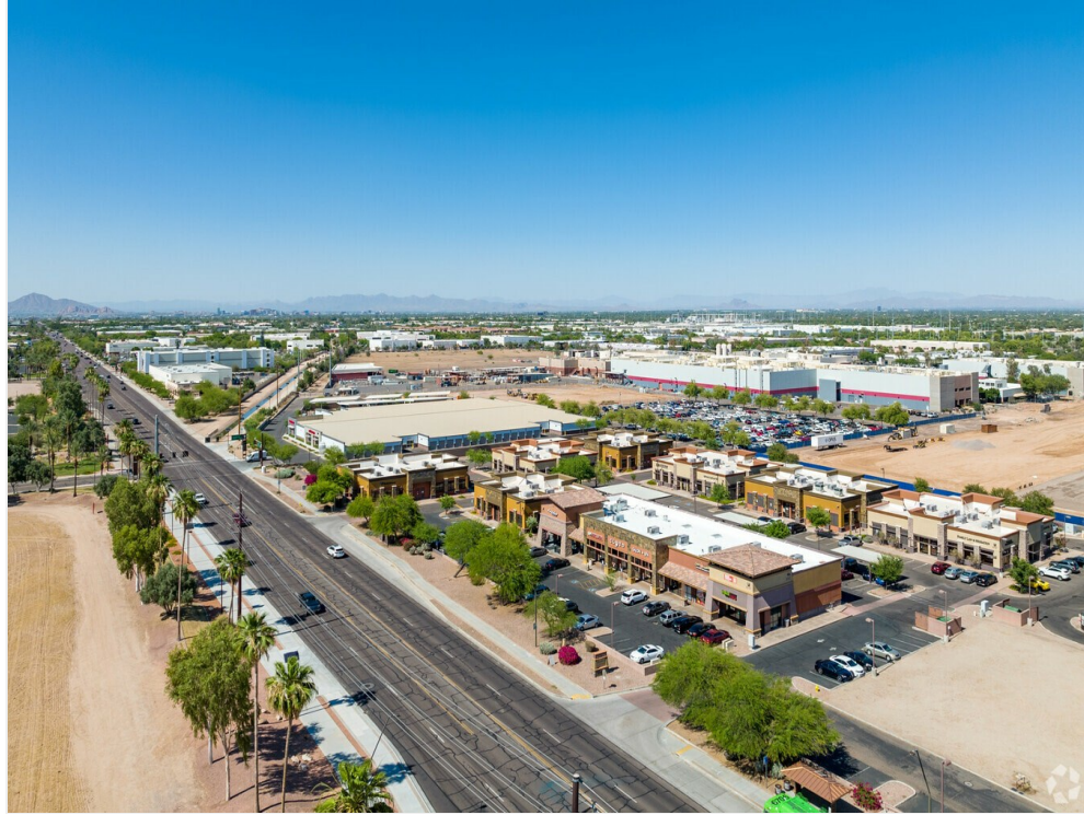
Proximity to Arizona State University