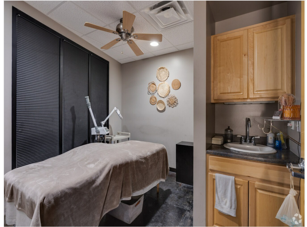
8707 S Priest Dr