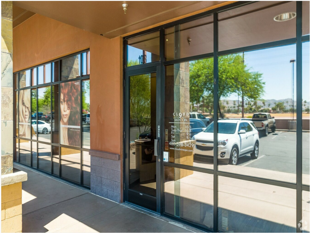
Floor-to-Ceiling Display Windows