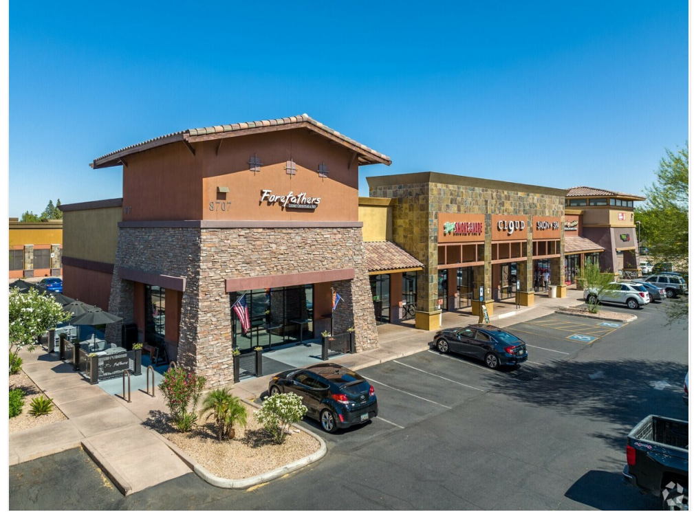
Bustling Shopping Center