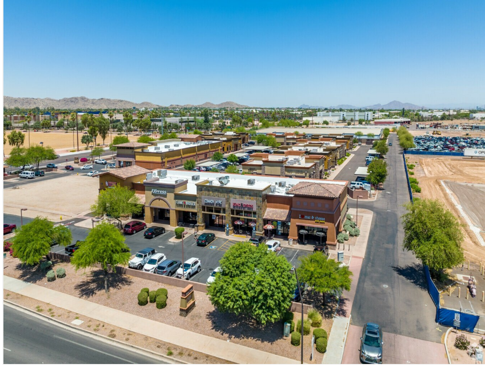
Prominently Placed in an Affluent Suburb