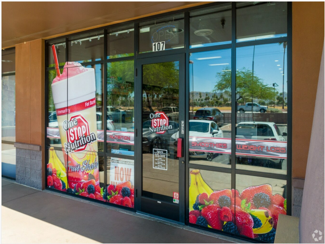
High-Quality Storefront Retail