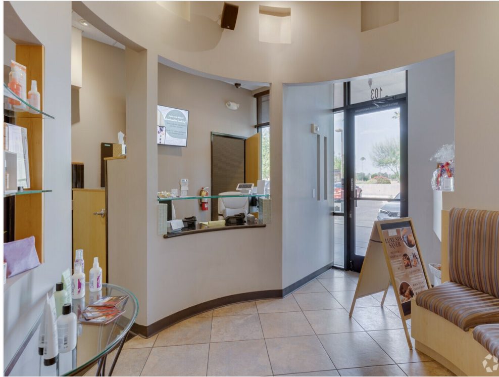
8707 S Priest Dr Suite A106