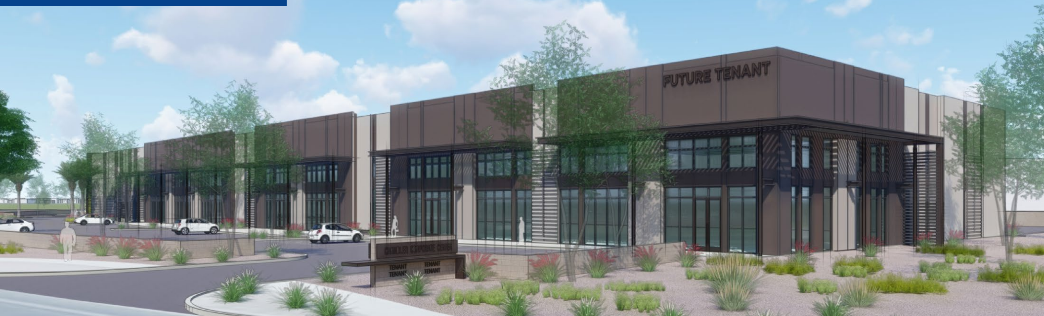
Galveston Main Entrance