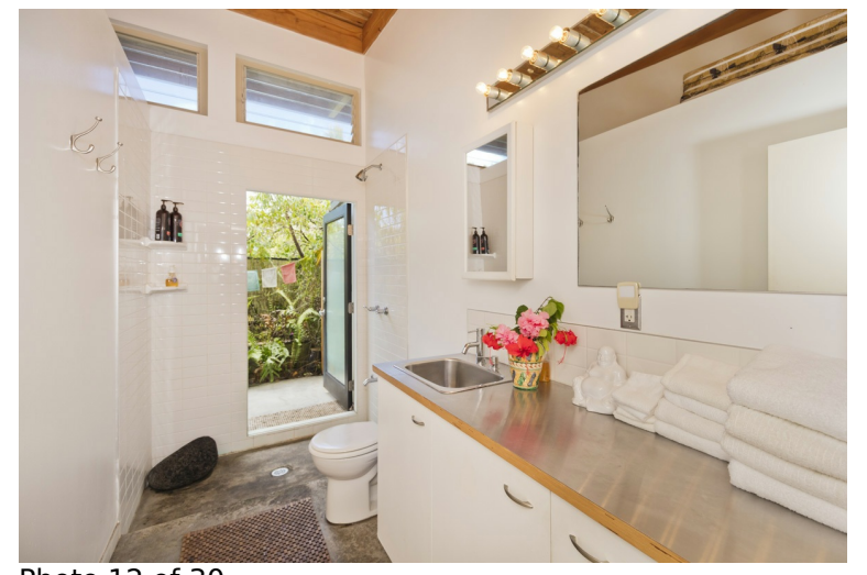
Photo 12 of 30 The "Loft" bathroom has a shower that walks out to the covered lanai. Stainless Steel countertops and subway tiles f...