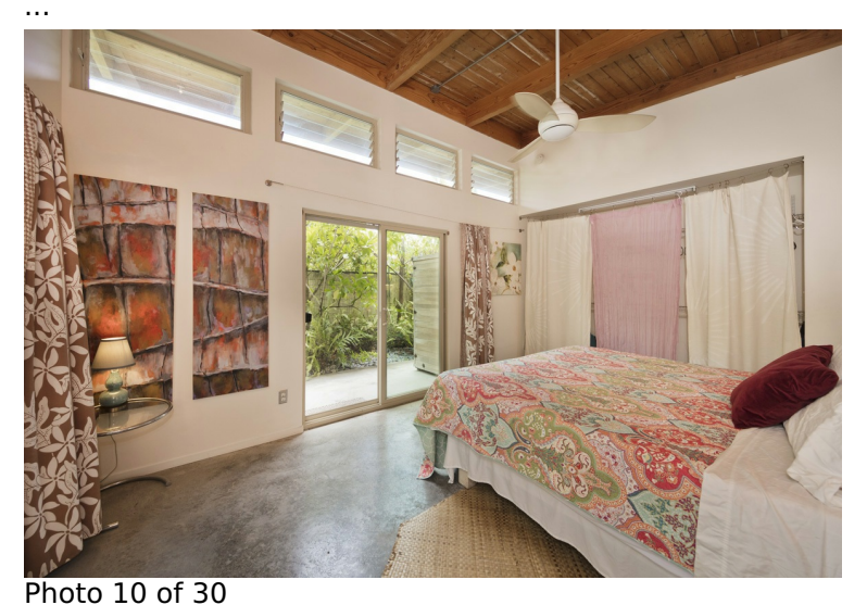
The "Loft" sleeping area looks out to the gardens.