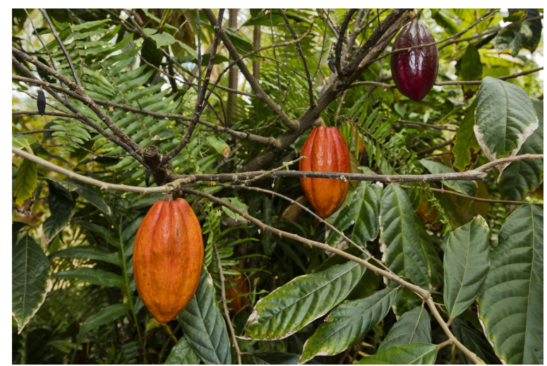
Photo 26 of 30 Cacao is abundant!! Many other tropical fruit trees are in full production between all 3 parcels.