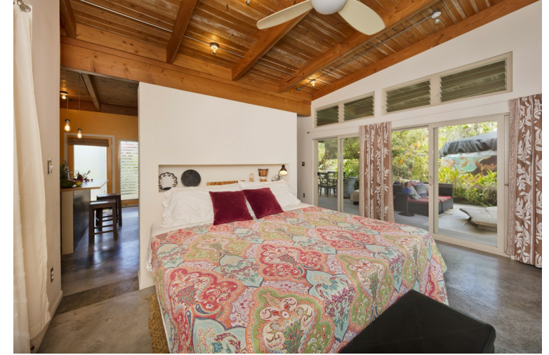
Photo 11 of 30 The "Loft" sleeping area where you can access the covered lanai, living room, and kitchen.