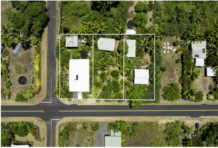
Photo 1 of 30 Wai Mana Eco-Conscious Sanctuary currently uses all 3 properties and includes beautiful gardens walking trails, a Yog...