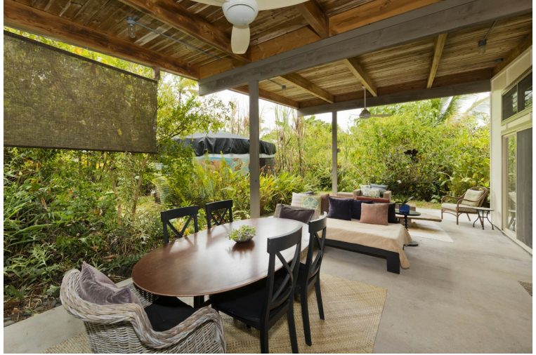
Photo 9 of 30 The 896 sq ft covered lanai with wrap-around walkways for all weather enjoyment for your indoor-outdoor lifestyle. Th...