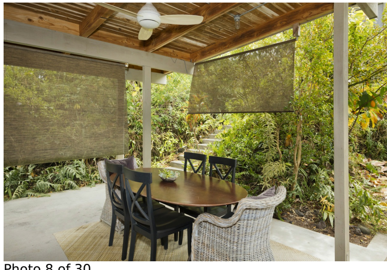
Photo 8 of 30 The dining room is situated on the 896 sq ft covered lanai and surrounded by abundant gardens. Located close to the