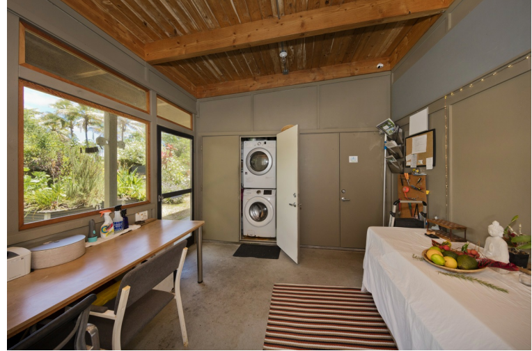
Photo 23 of 30 The Owner's Office and Laundry room is screened in and looks out to the lush gardens.