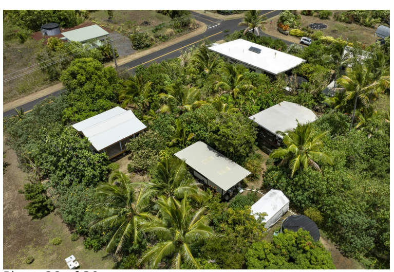
Photo 28 of 30 All 3 adjacent parcels. The residence is to the right.