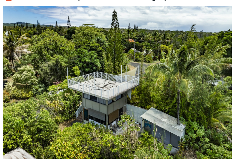
Photo 13 of 30 The Tower Minihouse is connected to the main residence by The Minihouse sleeping area in the Tower. a paved walkway. It is 100% private from the spaces at the...