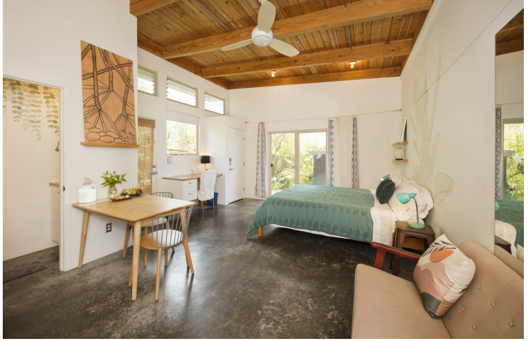
Photo 18 of 30 The "Ohana" is situated adjacent to the Loft. It can be integrated as 1 unit, or it can be locked off for other uses...