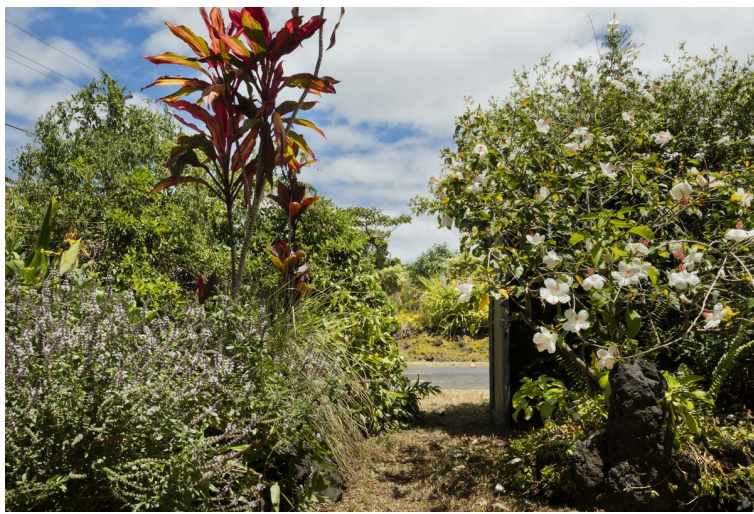
Photo 25 of 30 The side entry is private and filled with herbs, flowers, and salad greens. What an entry!