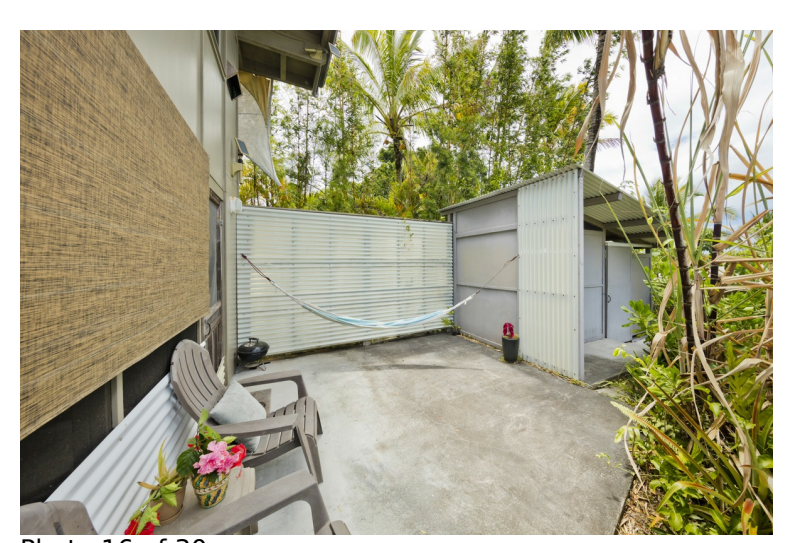
Photo 16 of 30 The Minihouse outdoor lanai. There is a bathroom beyond.