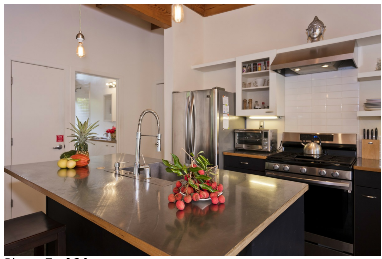
Photo 7 of 30 The kitchen offers an island with a breakfast bar, a gas stove, and stainless steel appliances.