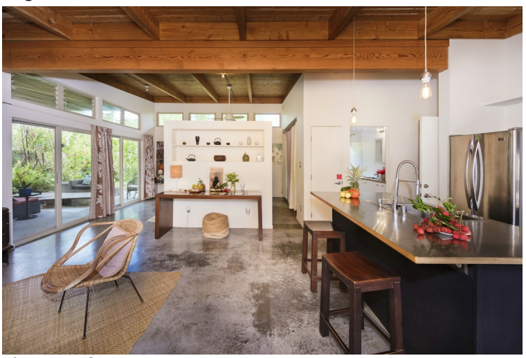
Photo 3 of 30 Walking into the main residence, the "Loft" which has a full kitchen, bathroom, and a large 896 st ft covered lanai f...