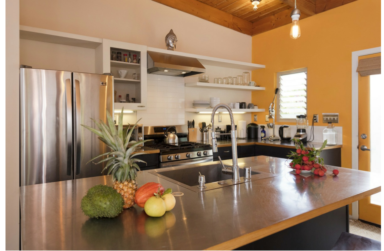
Photo 5 of 30 Photo 6 of 30 Stainless Steel countertops and open shelving in the kitchen Living room to kitchen provide a clean and modern space.