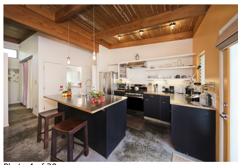
Photo 4 of 30 "L" shaped kitchen with an island and breakfast bar facing the living room offers an easy flow to the living room, sl...