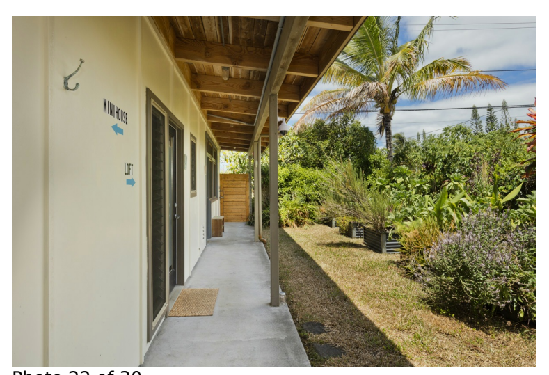
Photo 22 of 30 Covered walkway. Leads to the parking area through the wood door, the Loft, the owner's office, or the Minhouse.