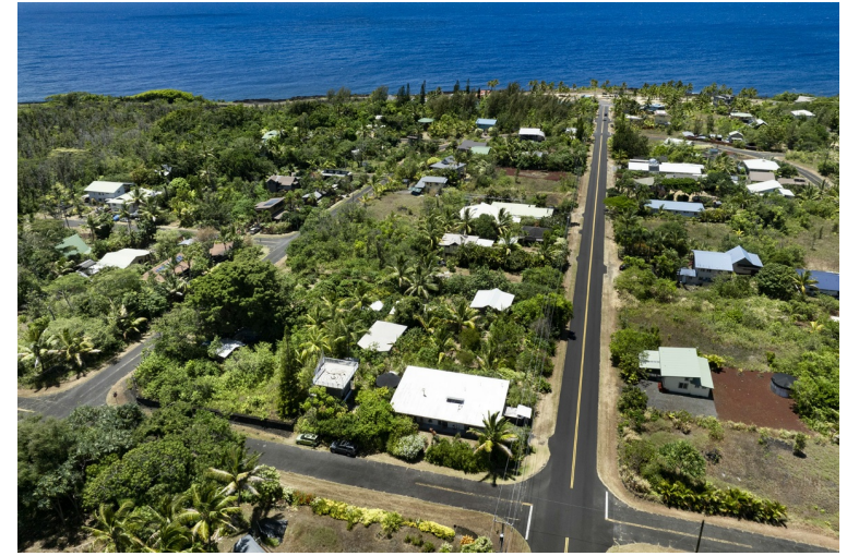
Photo 29 of 30 Located close to the ocean, and a short walk to the Seaview All 3 parcels offer a multitude of uses in housing and self Lawn, one of 3 parks Seaview residents get to enjoy.