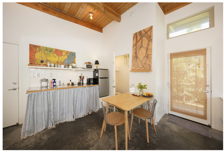
Photo 19 of 30 The Ohana wet bar and 1/4 bathroom. Through the door to