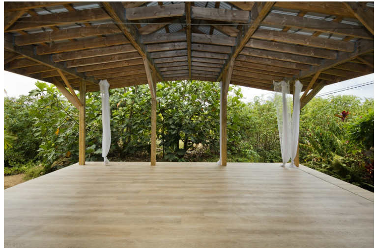
Photo 27 of 30 The newly constructed Yoga Temple on the 3rd lot is situated amidst fruit trees and abundant gardens. What a lovely ...