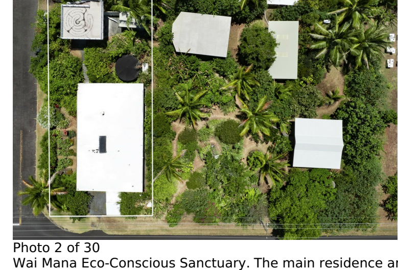
Wai Mana Eco-Conscious Sanctuary. The main residence and the Tower with a rooftop deck and Labyrinth. Adjacent 2 pr...