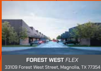
FOREST WEST FLEX 33109 Forest West Street, Magnolia, TX 77354