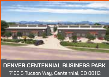
DENVER CENTENNIAL BUSINESS PARK 7165 S Tucson Way, Centennial, CO 80112