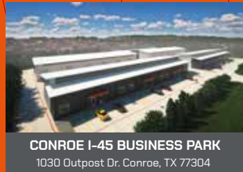
CONROE I-45 BUSINESS PARK 1030 Outpost Dr. Conroe, TX 77304