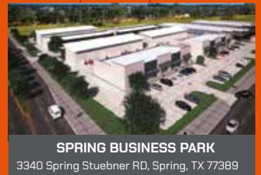
SPRING BUSINESS PARK 3340 Spring Stuebner RD, Spring, TX 77389

331 Corporate Woods Dr, Suite F-1, Magnolia, TX 77354