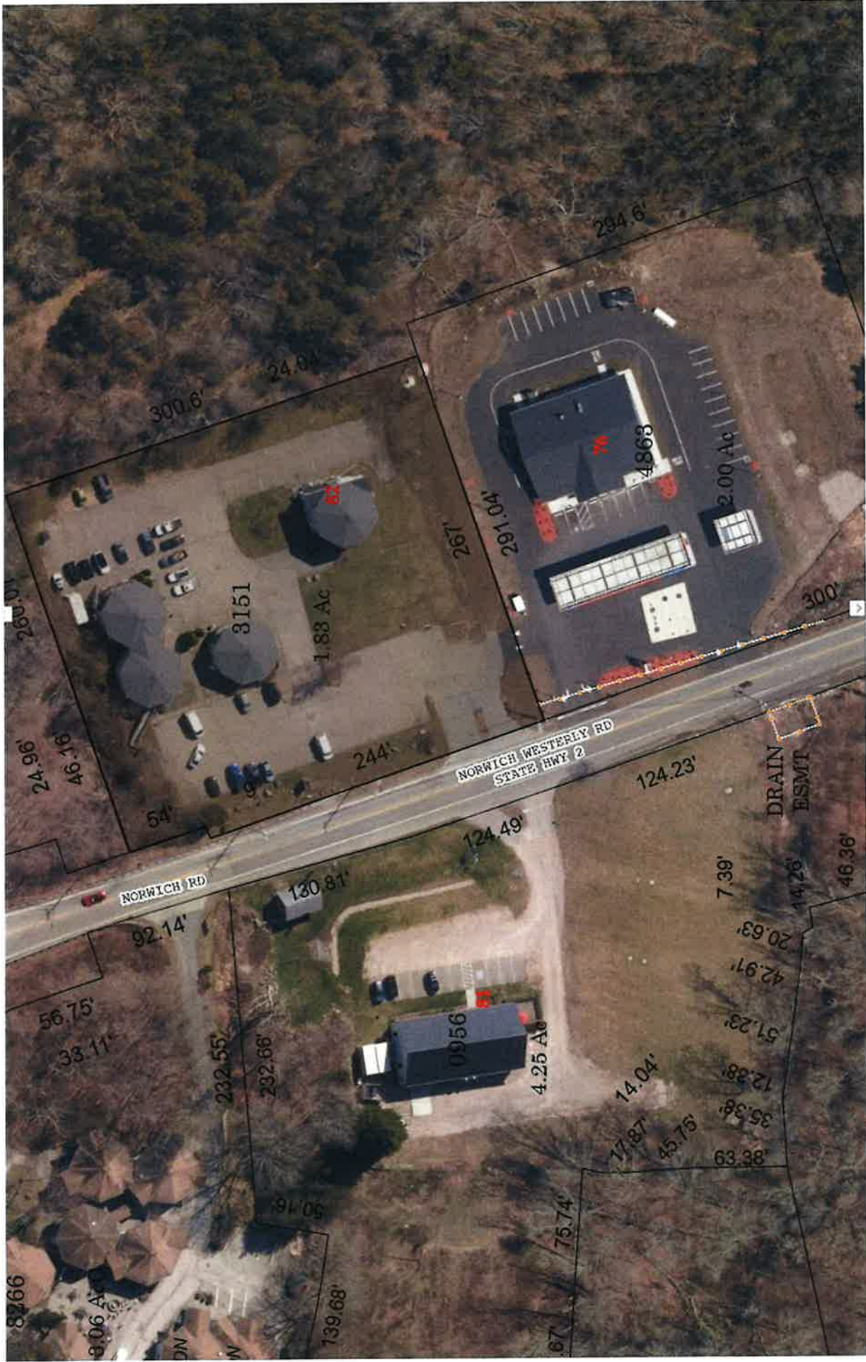
NORTH STONINGTON, CT, 82 NORWICH WESTERLY ROAD, GIS MAP 2023, IMAGE NUMBER 3151