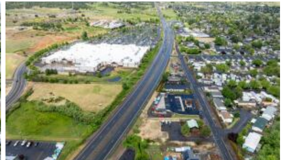
Across Hwy from Walmart and Ace Hdw