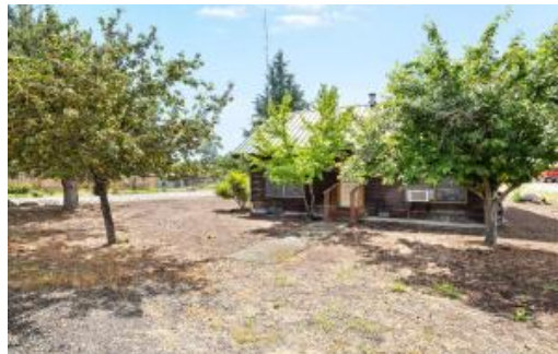
Old Crater Lake Hwy Back entrance