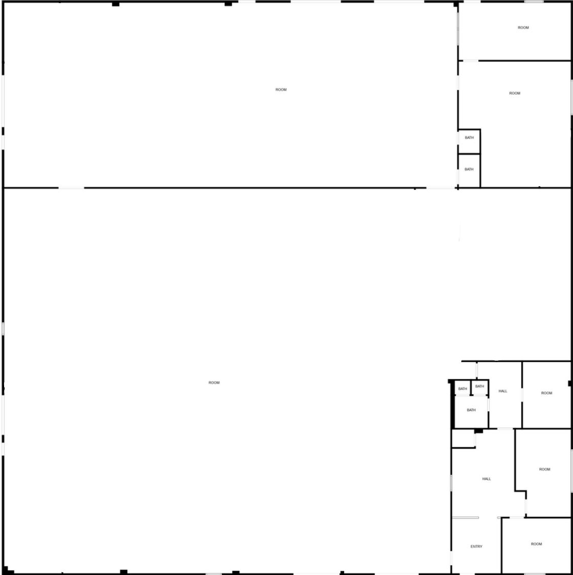
FLOOR PLAN CREATED BY CUBICASA APP. MEASUREMENTS DEEMED HIGHLY RELIABLE BUT NOT GUARANTEED.