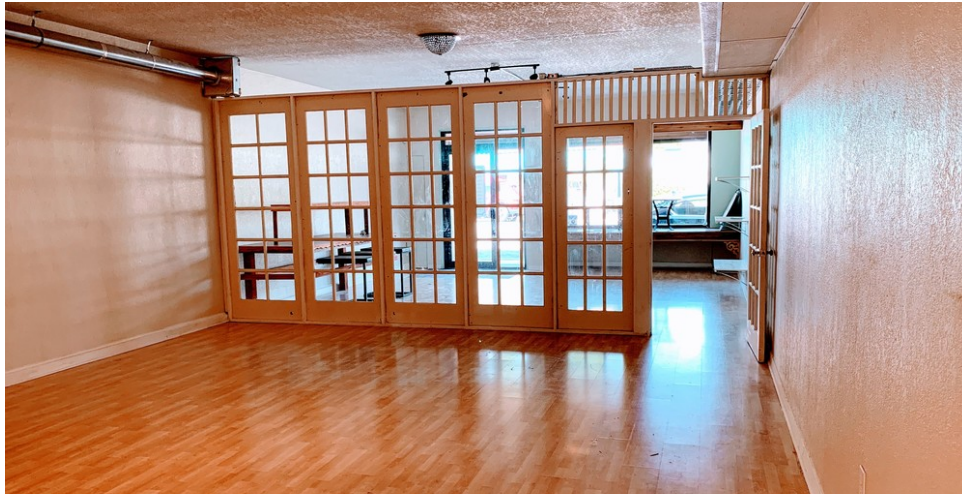
Inside Unit 1319

1317 - 1319 Edgewater Drive, Orlando, FL 32804