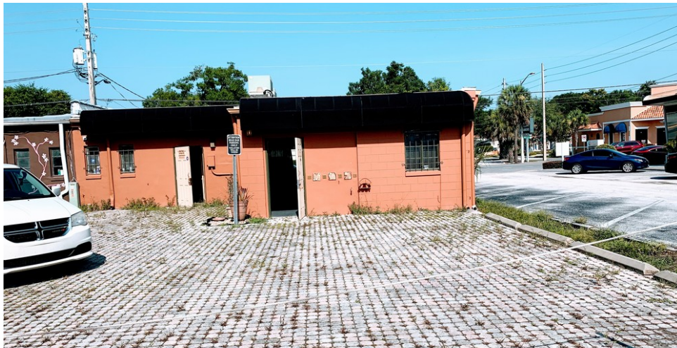
Additional Parking in the back