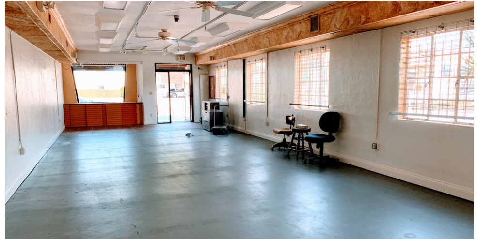
Inside unit 1317