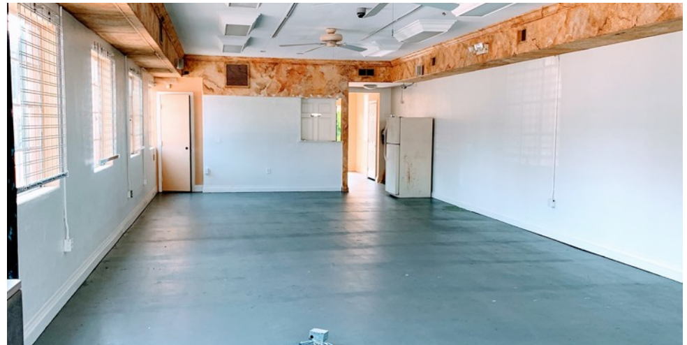
Inside unit 1317

KW COMMERCIAL 11 S Bumby Ave., Suite 200 Orlando, FL 32803