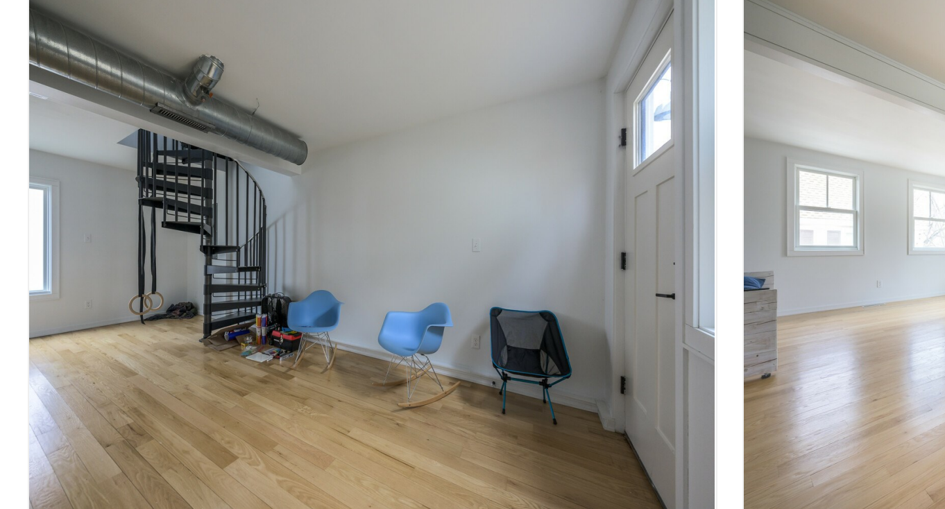
Carriage House/Apartment - 25 Columbia Turnpike Hudson NY 12534