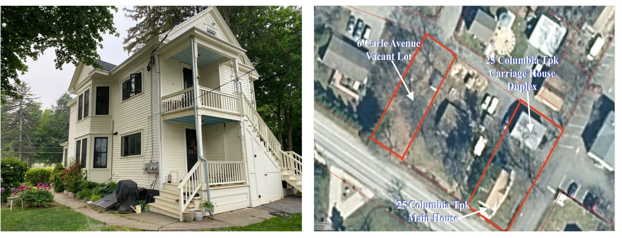
Exterior - 25 Columbia Tpke Hudson