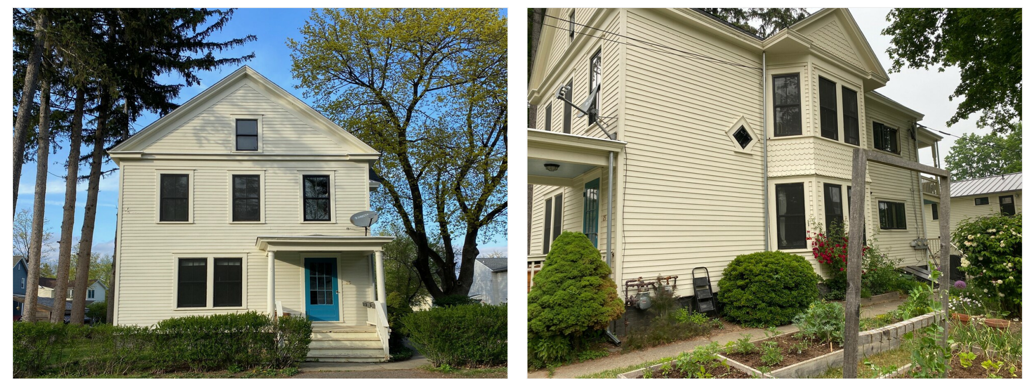
Exterior - 25 Columbia Tpke Hudson