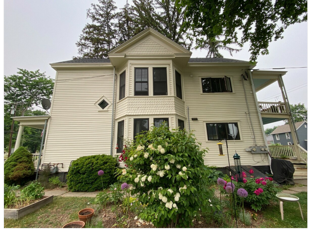
Exterior - 25 Columbia Tpke Hudson