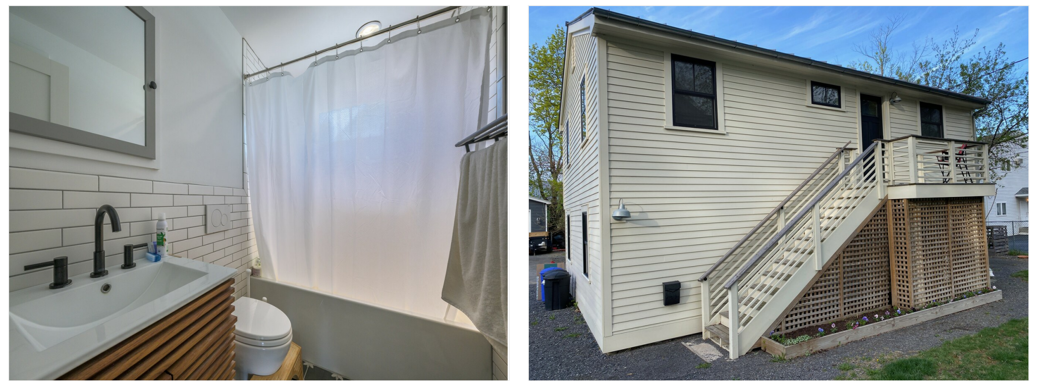
Carriage House/Apartment - 25 Columbia Turnpike Hudson NY 12534