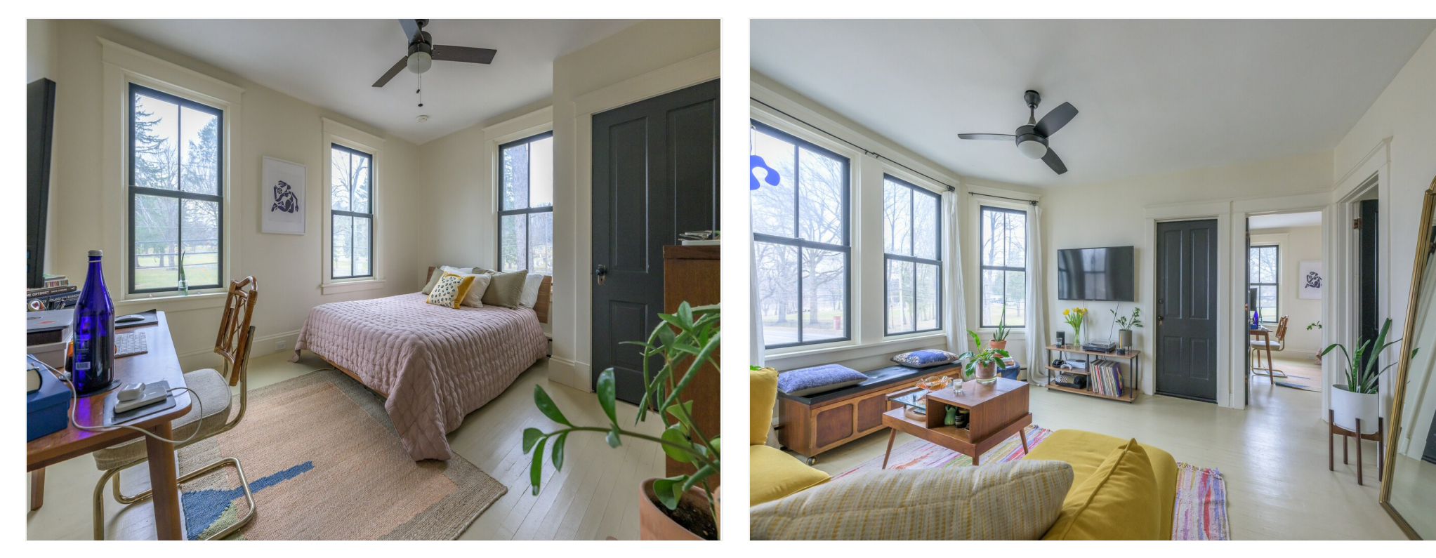
2nd Floor - Bedroom 1