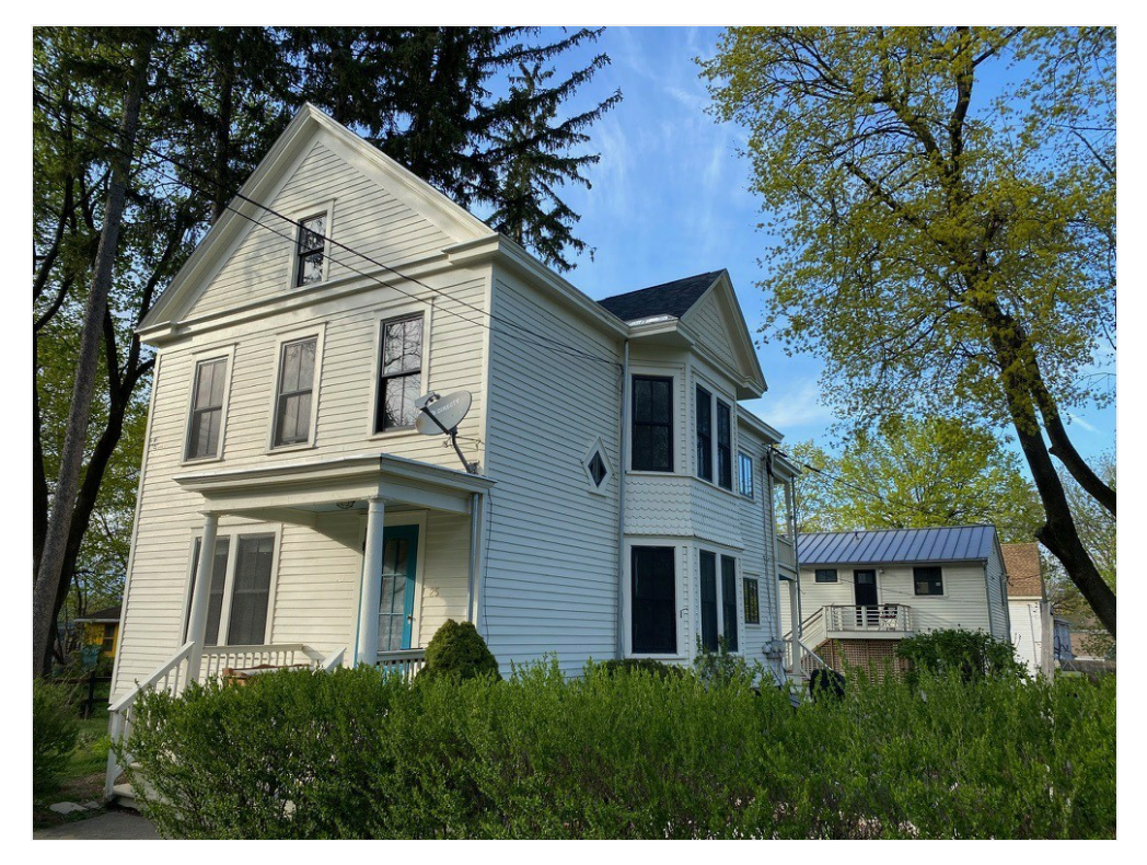
Exterior - 25 Columbia Tpke Hudson