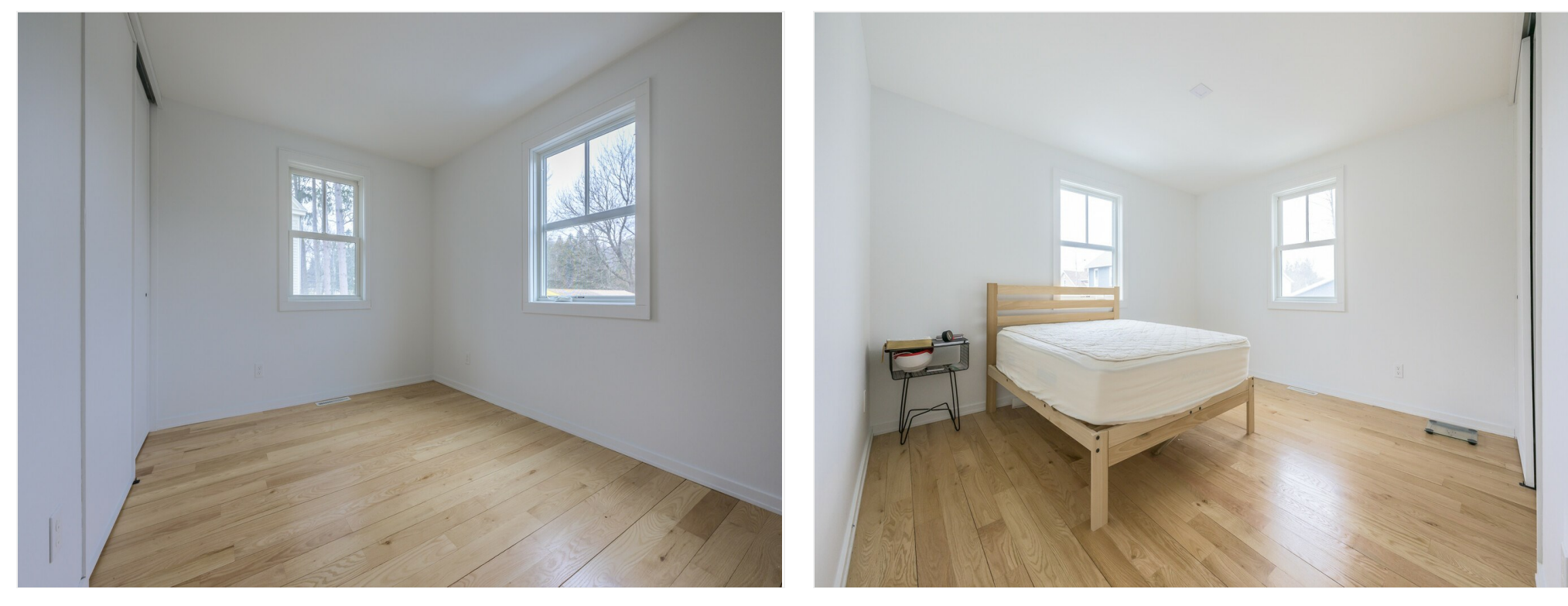
Carriage House/Apartment - 25 Columbia Turnpike Hudson NY 12534