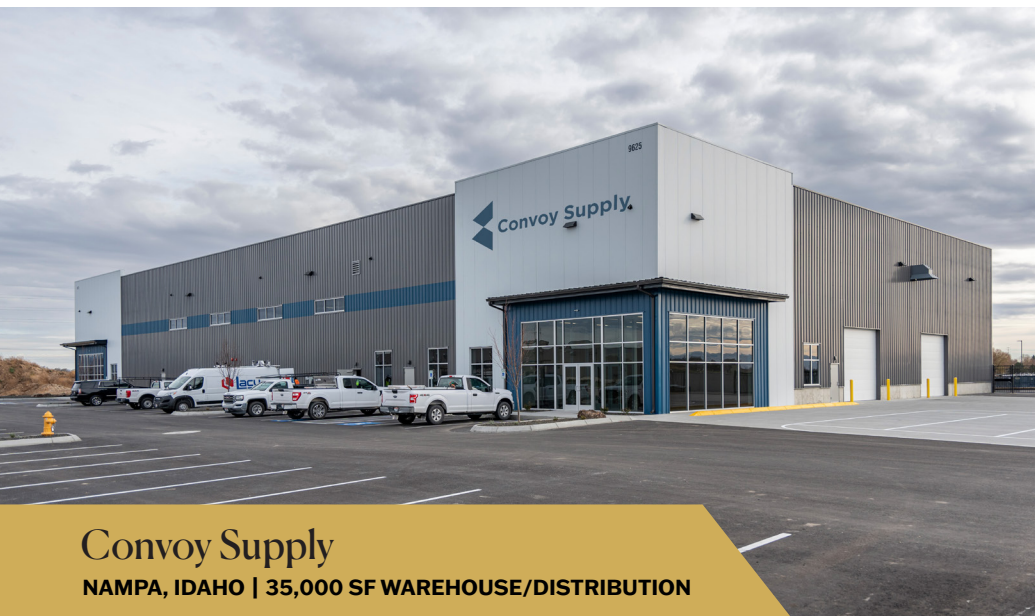
Convoy Supply NAMPA, IDAHO | 35,000 SF WAREHOUSE/DISTRIBUTION