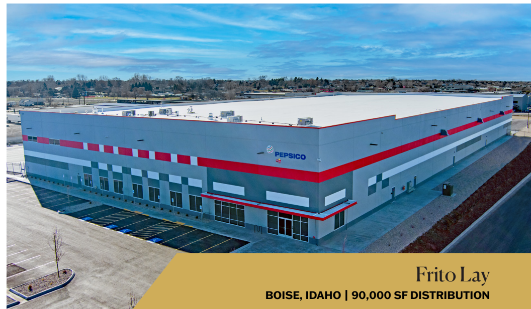
Frito Lay BOISE, IDAHO | 90,000 SF DISTRIBUTION