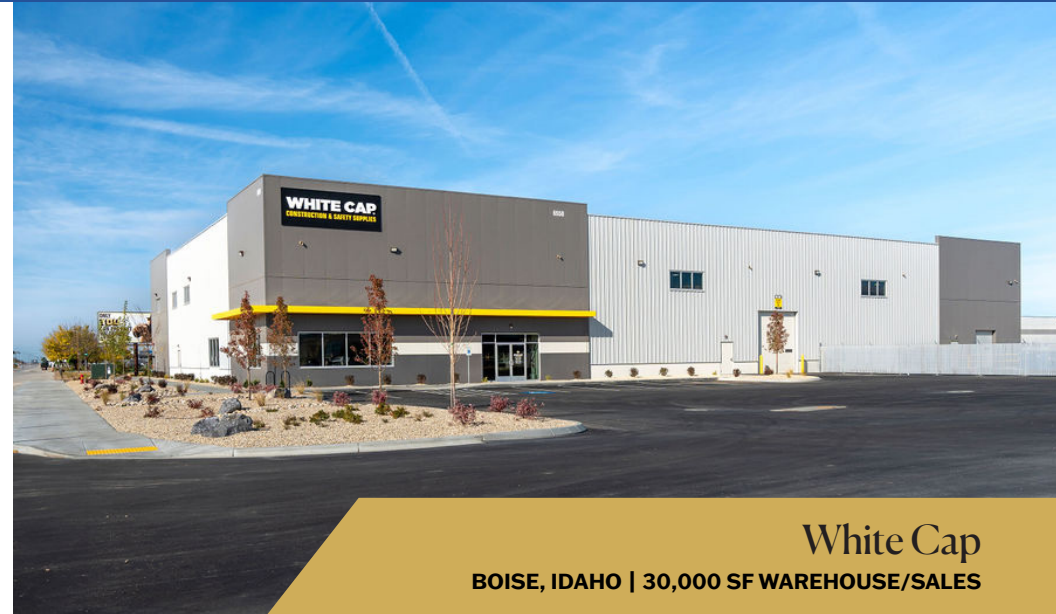
White Cap BOISE, IDAHO | 30,000 SF WAREHOUSE/SALES