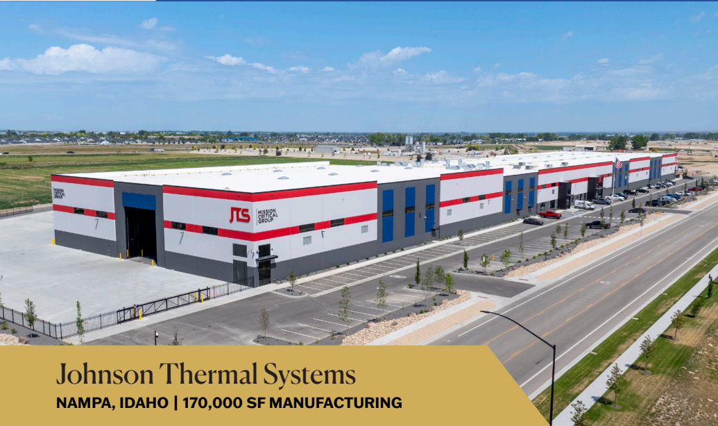
Johnson Thermal Systems NAMPA, IDAHO | 170,000 SF MANUFACTURING