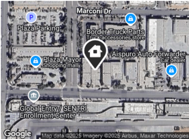
Legend: Subject Property