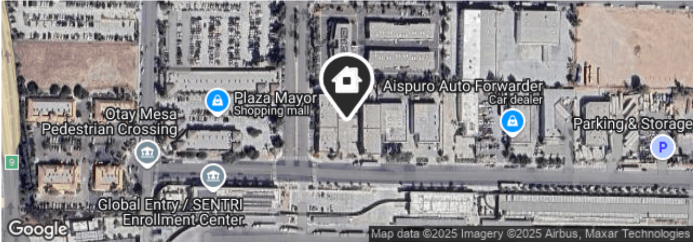
Legend: Subject Property