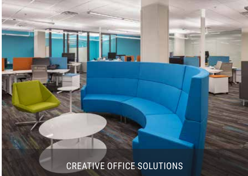
CREATIVE OFFICE SOLUTIONS