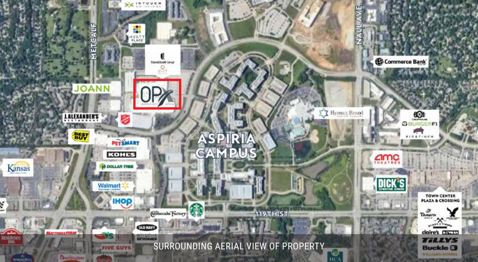
SURROUNDING AERIAL VIEW OF PROPERTY