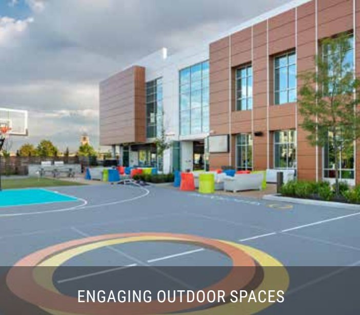
ENGAGING OUTDOOR SPACES