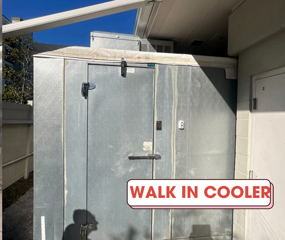
WALK IN COOLER